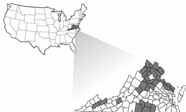
Figure 1 | Counties where VAHWQP drinking water clinics were held in 2013.

Each VAHWQP sample kit includes a survey designed to collect selected household demographic characteristics, including the average household income, the level of education and age of each household member and whether or not each person in the household consumes the water supplied by the private water supply system. Previous research exploring relationships between household water quality and private water supply system design characteristics is available in Allevi et al. (2013) .