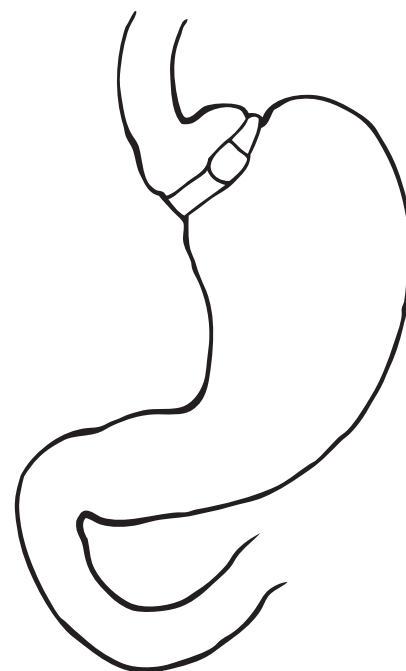
Figure 3. Laparoscopic adjustable gastric banding

Although there may be less profound weight loss associated with this procedure, a major advantage is the lower rate of complications. Operative mortality is estimated to be 0.05%. 31 Morbidity includes a low risk of gastric herniation through the band (1–2%), gastric prolapse (1.8–5%), band erosion (0–7%), and, rarely, technical difficulty with port access. Rarely, patients cannot tolerate the band and require removal because of