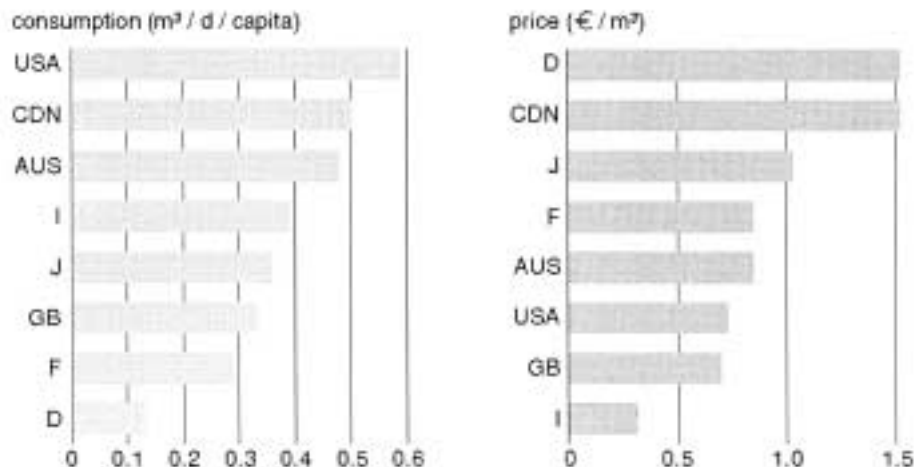
Figure 1 Average consumption and price of drinking water ( Wirtschaftswoche , 1998)

Experts know that the high investment costs in the water business – which to some extent do not depend on consumption figures anyway – react only very reluctantly to quantity changes in the consumption-related part. Hence, the low consumption figures in Germany having steadily declined over the last years inevitably lead to a relatively high price per cubic metre. In Germany, also the wastewater fees are generally charged according to the citizen’s fresh water withdrawal rate. The correlation between cost and quantity on the wastewater side is similar to that observed on the potable water side, whereby the quantity-related costs for a combined sewerage system, being designed for storm runoff, are even less affected by the specific consumption rates.