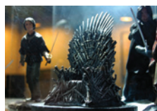
Allies with iron-dependent death

An iron-dependent form of cell death, ferroptosis, results from the accumulation of lipid peroxidation in tumor cells. CD8 + T cells secrete IFN \gamma , which decreases the amount of two subunits of a cystine transporter necessary to fend off this accumulation in tumor cells.