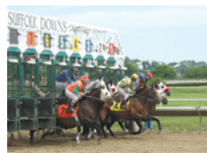
Releasing cDC2s

Migratory conventional dendritic cells (cDC2s) in tumor draining lymph nodes were identified by single-cell analysis from the heterogeneous myeloid population as critical for the proliferation of conventional CD4 + T cells. cDC2s can only fully prime CD4 + T cells if regulatory T cells are depleted or if anti-CTLA-4 treatment is given. Human tumors also have extensive heterogeneity among myeloid cells, and patients whose tumors had more cDC2s and fewer Tregs had the best prognoses, suggesting usefulness as a biomarker.