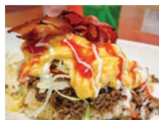
Fusions stimulate responses

A patient with an HPV - metastatic squamous cell carcinoma (SCC) responded completely to anti-PD-1. T cells recognized and were activated by a neoepitope formed by a fusion of two genes in the cancer cells. T-cell clones specific for this fusion-derived epitope increased with anti-PD-1 therapy, then decreased as the tumor regressed and stabilized at low numbers. Other patients' T cells were found to recognize other immunostimulatory fusion neoepitopes. Analysis of data sets from patients who received PD-1 blockade revealed that the frequency of fusions predicted to be immunogenic declined in responders, suggestive of immunoeediting.