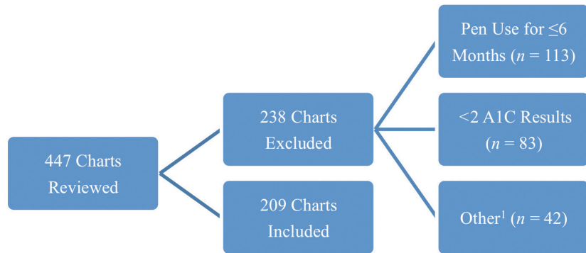
FIGURE 1. Flow chart of patients who met inclusion/exclusion criteria in the identified study population. 1 Excluded because they were living in nursing facility or hospice, converted from insulin pen to a vial, switched between delivery devices more than once, never used an insulin vial, or were not receiving the insulin pen from the study facility.

Although the change in A1C was not statistically significant, the analysis found a significant difference in the number of units per kilogram per day when using the vial versus the pen. The average insulin aspart dose increased after conversion to the insulin pen device. While using insulin aspart vials, patients used an average of 0.545 units/kg body wt/day versus 0.618 units/kg body wt/day while using insulin aspart pens ( P < 0.001 ). There was no statistical difference in patient weight after conversion to the pen (105.2 vs. 104.5 kg, P = 0.11 ). Basal insulin doses were similar