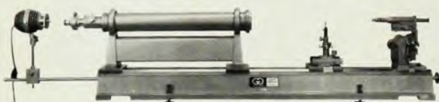
Precision Lathe Bed Optical Bench.

Exceptionally versatile, for the most critical applications involving checking optics and experimental setups.