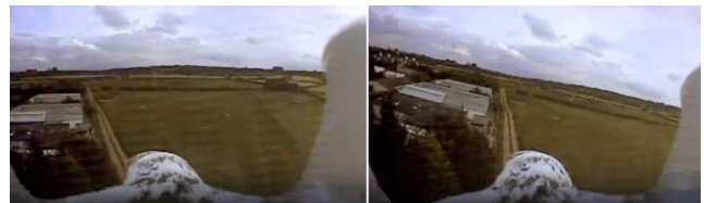
Fig. 1. Video device mounted on a pigeon during flight to monitor visual navigation [National Geographic, 2011].

Small lightweight video camera devices have been mounted onto a pigeon during flight which revealed the bird's eye view during pigeon navigation (Fig. 1). Results from analysis of these videos and real-time GPS tracking data during pigeon flights show that pigeons use visual navigation to follow roads, rivers, or coastlines which lead towards their loft during flights within familiar territory or within the last leg of a longer journey (Biro et al., 2004). These findings suggest that navigation within one mile of the loft is led by visual navigation of recognised landmarks. The outline of landmarks must be visible for pigeons to recognise them correctly (Gibson et al., 2015). This suggests that navigation by solar clock and magnetoception may not be accurate enough for locating the exact loft, but guides to within the correct mile. This would explain why pigeons become lost when released without first seeing and becoming familiar with the loft's surroundings, which is a core part of training for homing pigeons. Within visual navigation (i) landmarks, (ii) flocking and (iii) familiar scenes play a part in guiding pigeons. This research aims to identify their roles in simulated navigation.