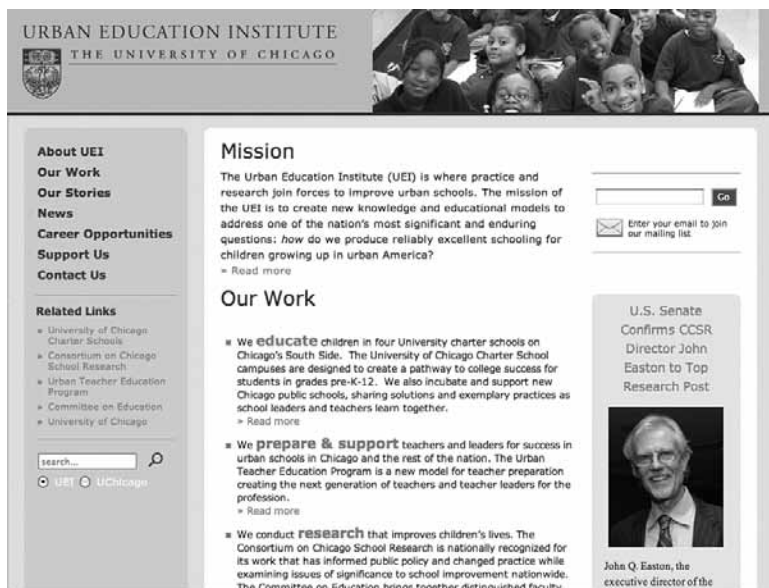
Figure 5.1 Screenshot of the home page of the Urban Education Institute ( http://uei.uchicago.edu/index.shtml , accessed July 5, 2009).

versity members, youth, family, and funding agency. Another good example of such a complex institutional partnership would be the Sustainable South Bronx project in New York City. This is a community network, drawing on local residents and youth, to mobilize both to learn and do something about the considerable environmental challenges facing residents of the South Bronx. In creating the toolset to collect and disseminate information, to mobilize politically around these counterknowledges, to design and build environmentally conscious tools to address issues of sustainable environmental practice, the Sustainable