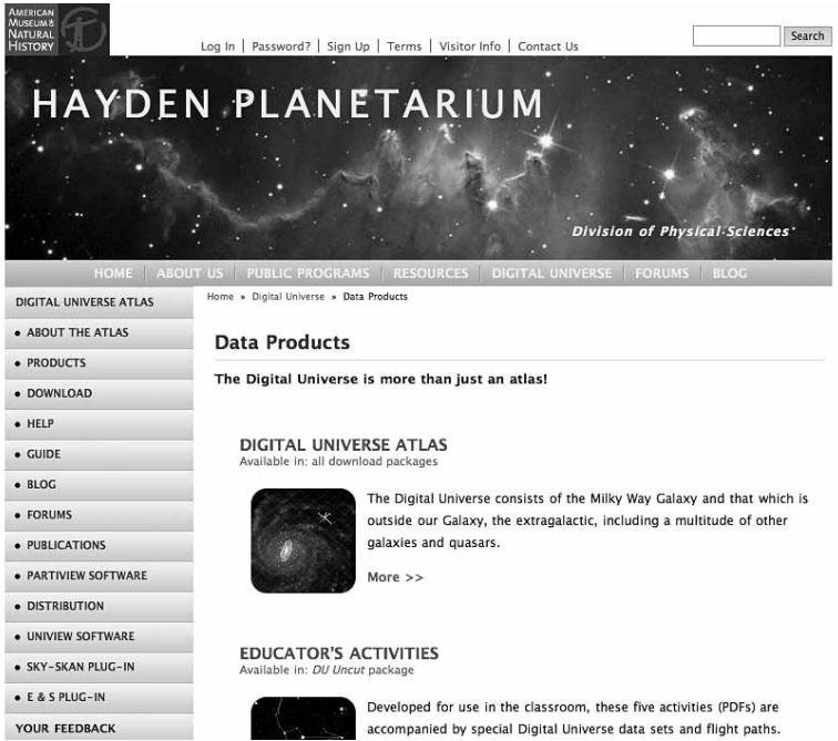
Figure 5.4 Screenshot of Hayden Planetarium’s Digital Universe Atlas ( http://www.haydenplanetarium.org/universe/products , accessed July 5, 2009).

information, if not itself offering criteria for distinguishing compelling from questionable sources. Its mobilizing capacity and promise are borne out by the fact that its brand name has become a widely invoked verb, even sometime imperative: Googling , to Google , or just Google (it) ! This is so much the case that we now have the reverse formation, the fearful version, as in what Siva Vaidhyanathan calls “The Googlization of Everything.” 10