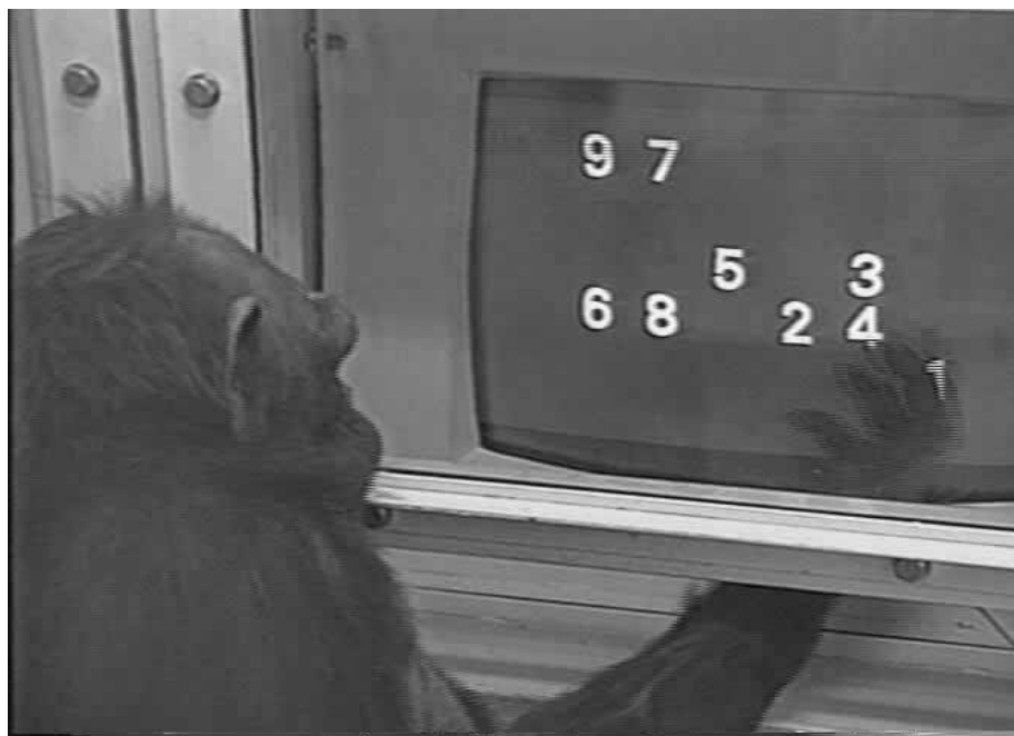
Figure 25.2 The chimpanzee Ai is selecting numerals in an ascending order.

Chloé, and Pan, have learned a variety of computer skills, in addition to many different kinds of tool use much like those of wild chimpanzees. How can such knowledge and skills be transmitted from one generation to the next? When are they transmitted? And from who to whom?