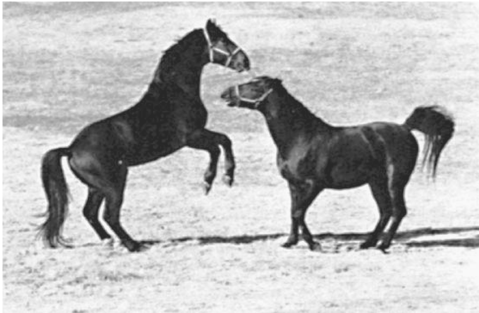
Figure 1.2 Social play in young male horses. (From Waring, 1983)