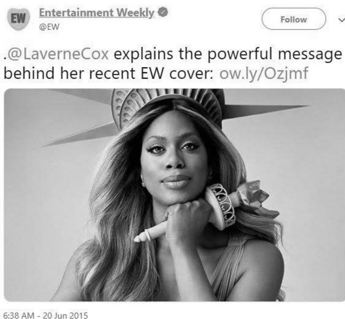
Figure 3.7 Laverne Cox as Lady Liberty.

Ultimately, the discursive work done by members of the #GirlsLikeUs counterpublic works to both center trans politics and normalize trans lives by using the hashtag to mark the mundane, the popular, and the activist. It is clear from this discourse and from our network analysis that #GirlsLikeUs prioritized