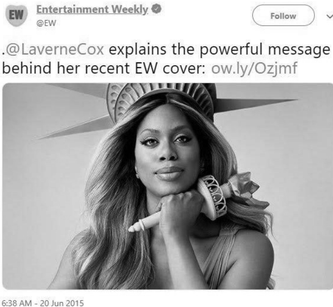
Figure 3.7 Laverne Cox as Lady Liberty.

Ultimately, the discursive work done by members of the #GirlsLikeUs counterpublic works to both center trans politics and normalize trans lives by using the hashtag to mark the mundane, the popular, and the activist. It is clear from this discourse and from our network analysis that #GirlsLikeUs prioritized