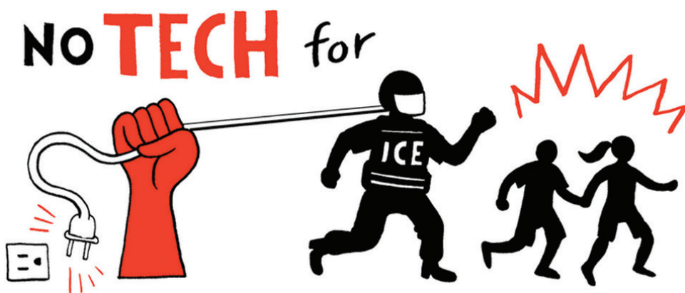
Figure 6.1 No Tech for ICE , from the #TechWontBuildIt campaign.

To: Talent Acquisition at Amazon. Thank you for reaching out. While I'm sure this would be a great opportunity, I have no interest in working for a company that so eagerly provides the infrastructure that ICE relies on to keep human beings in cages, that sells facial recognition technology to police, and that treats its warehouse workers as less than human. Best wishes, [redacted].