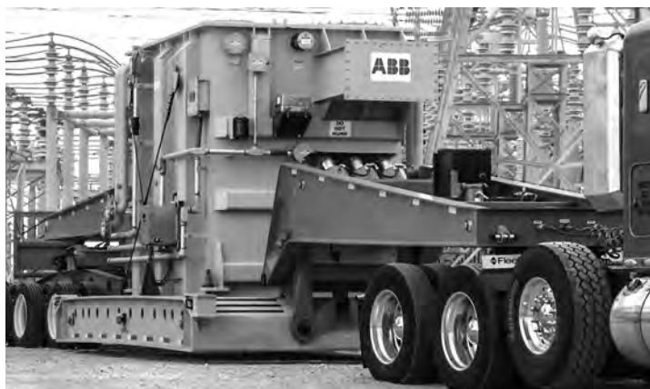
1.4 Outages are not just overnight when major equipment fails: a RecX “spare tire” recovery transformer arrives at a substation.