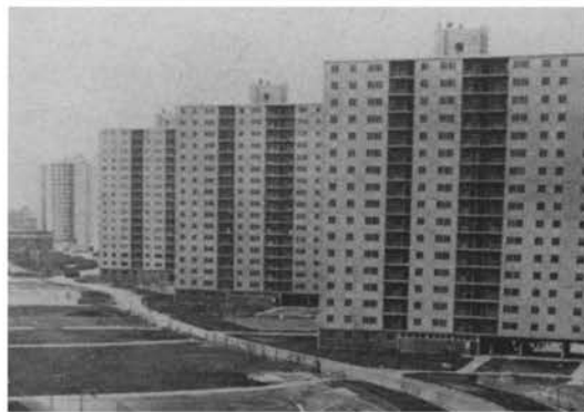
1 Monolithic flats on the European urban periphery: the Polygonos of Barcelona.