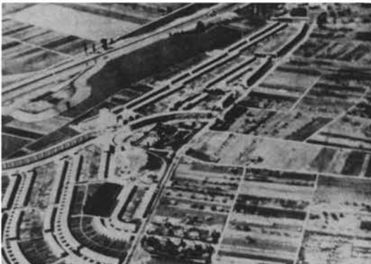
3 Housing estates on the suburban fringe: Römerstadt in Frankfurt by Ernst May, 1925–1930.