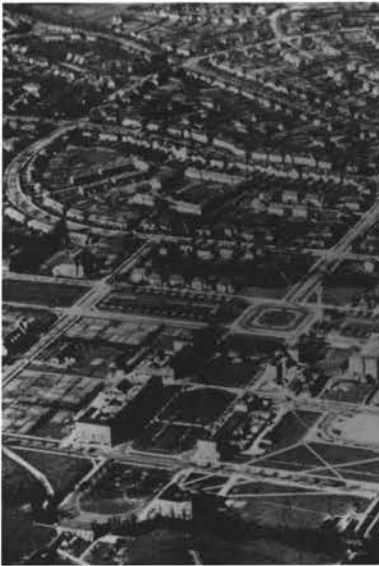
51 Application of garden city precepts at Letchworth by Raymond Unwin and Barry Parker, 1903–1919.

As we saw in chapter 1, prior to 1900 the production of housing was considerably industrialized in both the United States and Europe. Parts were manufactured in central locations and shipped to remote building sites for assembly into complete units. Industrialization was a way of making existing things quicker, more efficiently, and at greater profit. Nevertheless, the appearance and layout of houses went largely unaffected, still conforming to nineteenth-century neoclassical, romantic, and vernacular ideals.