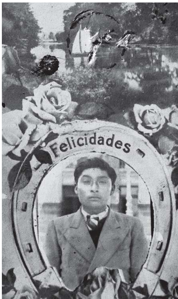
FIG. 1.3 Llamojha, Lima, 1939.