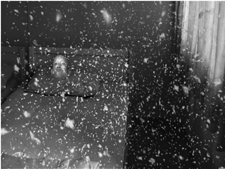
FIGURES 1.4–1.5. The head of the first man is superimposed on a pillow. The head of the second man is superimposed on the pillow to the right. Apichatpong Weerasethakul, Morakot (Emerald, 2007).