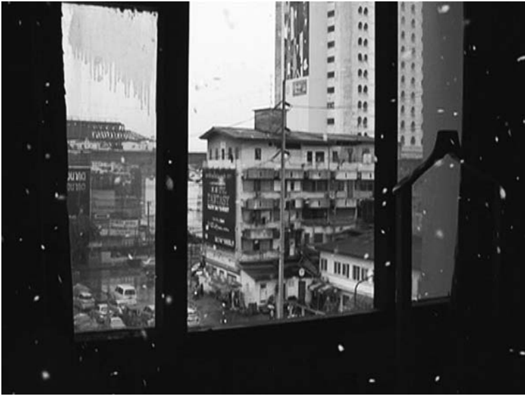
FIGURE 1.3. The view from the window shows a busy Bangkok intersection. Apichatpong Weerasethakul, Morakot (Emerald, 2007).

In Morakot Buddhist melancholia describes a process in which a chain of events that have to do with desire is arrested in its conventional tracks, as the film zooms in on and draws out a particular moment. Thus the reflections of one of the protagonists on a long-ago desire take up the better part of the narration. Instead of relegating this desire merely to a moment in her life, the duration of desire is expanded exponentially as Morakot's protagonists “take centuries to recite their stories to each other.”