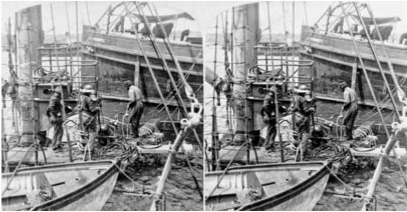
Figure 1.4 Stereoscopic photo of American divers at work, exploring the Maine wreck, Havana Harbor.

While the remains of the sailors were recovered and buried, arms and other personal belongings of the crew, remnants of furnishings and dishes, and fragments of the ship's hull were carefully packed and sent to the United States to begin a new life as "relics" displayed in public exhibitions or hoarded in private collections.