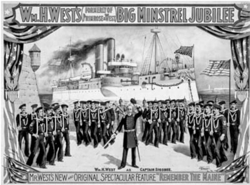
Figure 1.2 Wm. H. West's Big Minstrel Jubilee (formerly of Primrose & West).

graphs, and stereoscopic pictures. The scenes of the Maine 's catastrophe were represented in theatrical reenactments as well as in the short current-event documentaries with which the film industry made its debut. 9 The silhouette of the USS Maine became a kind of trademark of the year 1898, permanently marking the memories of those old enough to remember it, both in the United States and, of course, in Cuba.