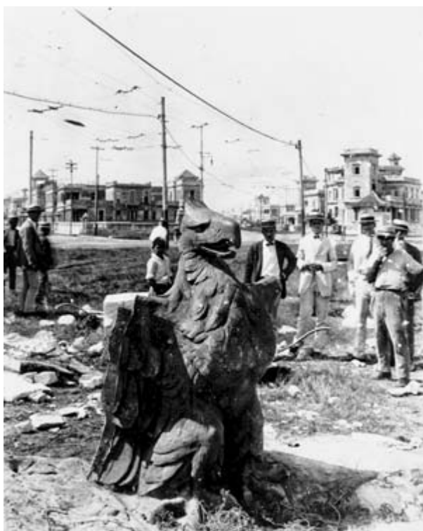
Figure 1.7 Bronze eagle from the monument to the victims of the Maine .

Forestier designed the plaza as a gateway that connected the old part of the city, across from the Malecón, with Vedado. As previously mentioned, both the Malecón—an avenue built during the first U.S. intervention that, with each new government, stretched out further west along the coastline—along with Vedado—a neighborhood made up of straight tree-lined streets, main avenues, parterres, and public parks, as well as chalets and cottages built in the style of U.S. suburbs—were paradigmatic models of the spatial transformation of the city on a U.S. model. 59 Early in 1928, motivated by both the celebration of the sixth international Conference of American States in Havana and a visit from the president of the United States, Calvin Coolidge, Gerardo Machado ostentatiously inaugurated the plaza. 60 In what largely resulted in an insult to the memory of nationalist patriots, the commemorative ceremony, which took place on October 10, the anniversary of the declaration of the war of independence against Spain, was celebrated in the Plaza del Maine with an impressive military parade.