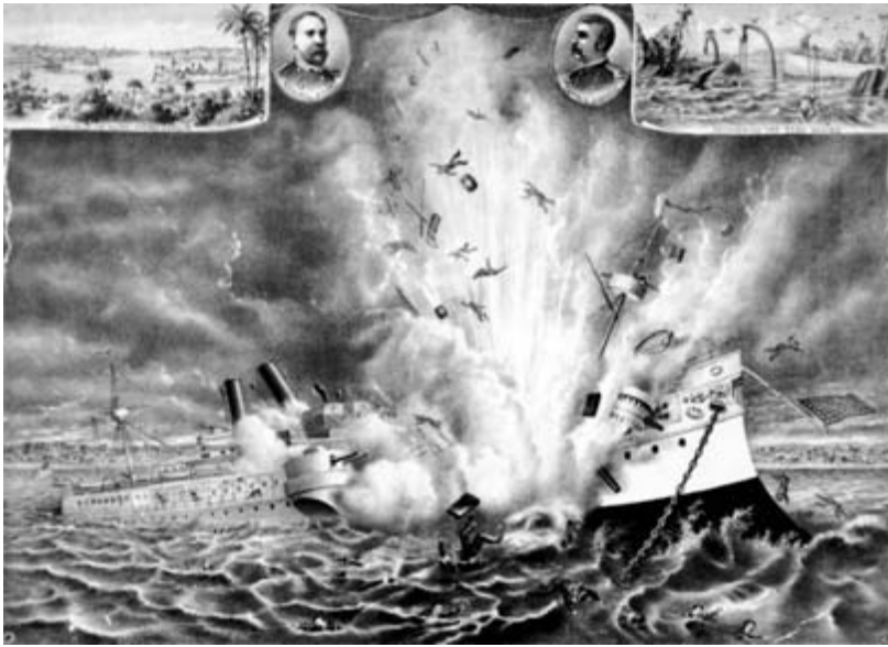
Figure 1.1 Destruction of the U.S. battleship Maine in Havana Harbor, February 15, 1898.