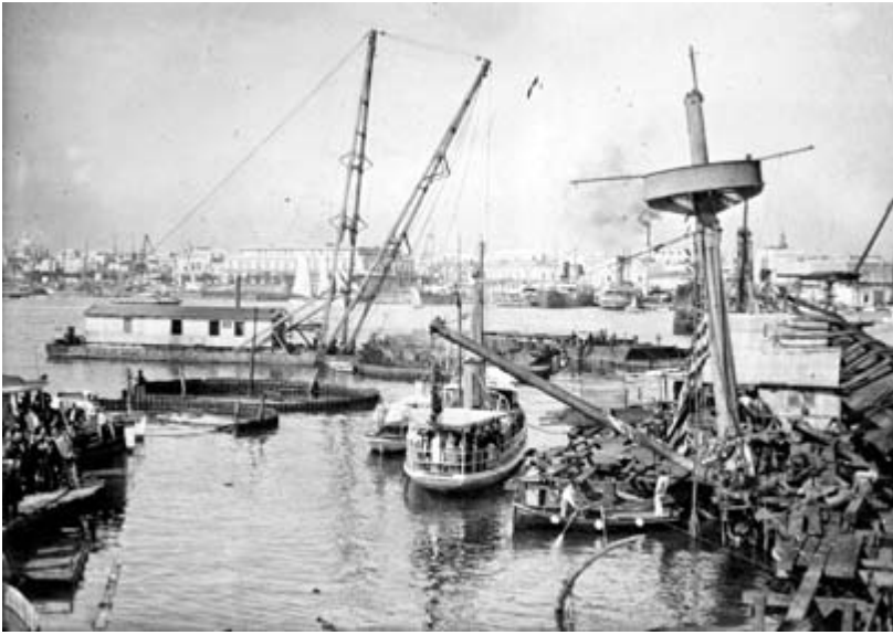
Figure 1.5 Maine in cofferdam, Havana.

that were now exposed to the light of day, only to concur with the expert conclusion of 1898, which had determined that an external cause (such as a mine or torpedo) had destroyed the navy ship. 32