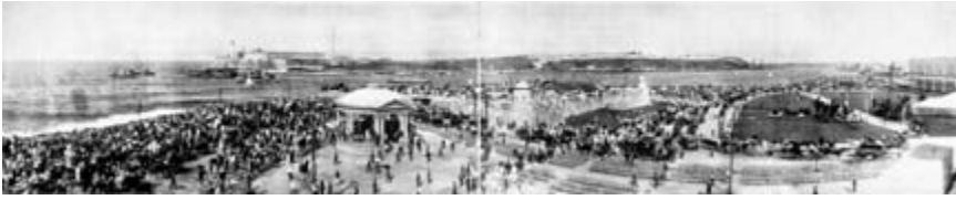
Figure I.6 The USS Maine going to her final resting place.

on March 15, 1912, the official burial of the USS Maine 's "cadaver" took place in Havana.