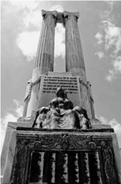
Figure 1.8 Monument to the victims of the Maine .

dictatorship. In 1930, with the construction of the deluxe Hotel Nacional next door to it, the monument became a site of obligatory pilgrimage for the hundreds of U.S. tourists who came to Cuba each winter. In 1953, the inauguration of a new building for the nearby U.S. embassy, a seven-story modernist building designed by Leland W. King, completed the definitive “Americanization” of the area. 61