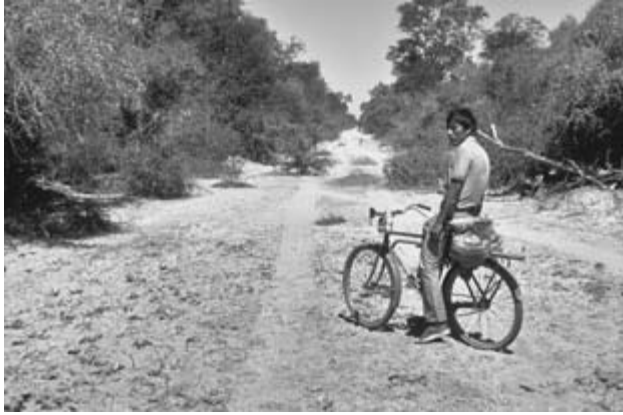
1. Bush trail in Toba lands.

natural component of the landscape but a historical product intrinsically linked to their incorporation within the Argentinean nation-state and their demise as a politically autonomous group. This history has constituted Toba subjectivity and produced the local geography, in a process in which the forces that made the Toba what they are today are the same that created the bush. This entanglement of space, history, and subjectivity involved not just the Chaco interior but also practices that connected the emerging bush with other geographies. In the early twentieth century, state violence, settler colonization, and the consolidation of a capitalist frontier 300 kilometers to the west drew the Toba and other indigenous groups into the orbit of sugar plantations as a seasonal labor force. This pattern of migration was a further and potent force in the making of the bush, as the place where people constructed a relative haven from labor exploitation yet also as the site deprived of commodities that fostered their annual return to the sugar cane fields.