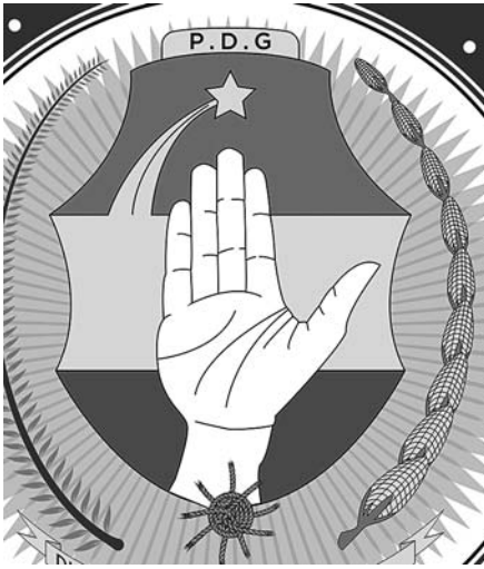
I.2 Emblem of the Parti démocratique gabonais (P.D.G.), featuring a disembodied hand.