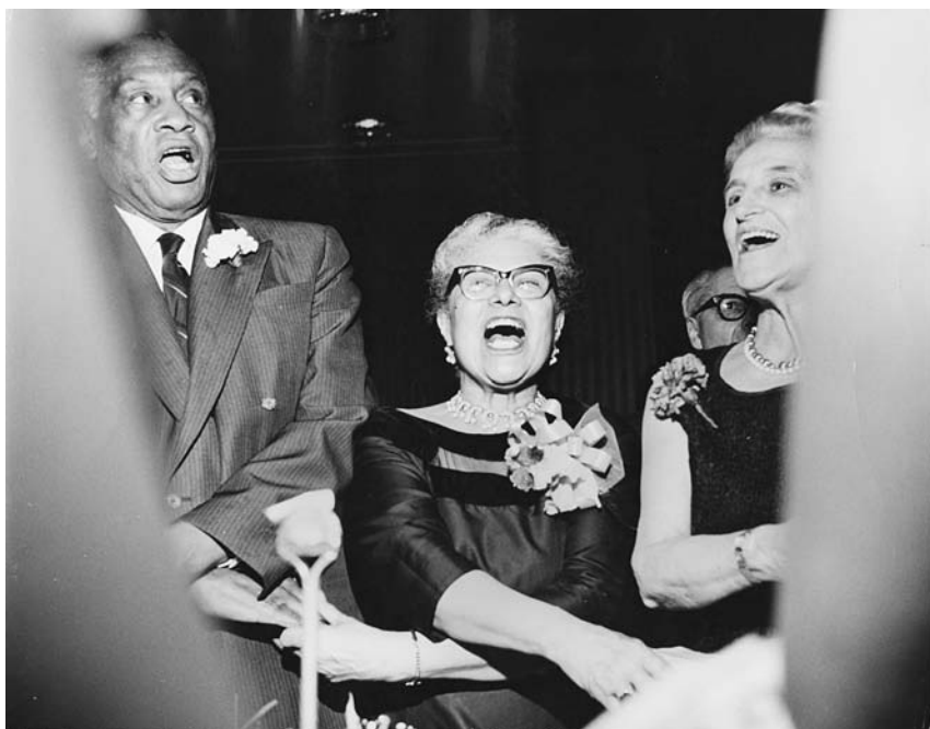
FIG. C.1 (Left to right) Paul Robeson, Eslanda Goode Robeson, and unidentified woman singing “We Shall Overcome” at Paul’s Welcome Home Birthday Salute in New York City, sponsored by Freedomways magazine (April 1965).

ronto; New York City; and Jamaica have also hosted days in his honor. 12 In 1976, the World Peace Council to the United Nations declared April 9 International Paul Robeson Day, an event honored throughout the world. 13 He continues to mark the seasons, not as an athlete but through his form as seed, specifically a Russian heirloom tomato, which has “developed almost a cult following among seed savers” (fig. C.2). 14 Paul, perennial.