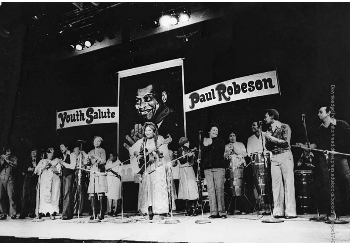
FIG. C.3 Singer Odetta (center) and musicians during the Youth Salute to Paul Robeson, December 1978.