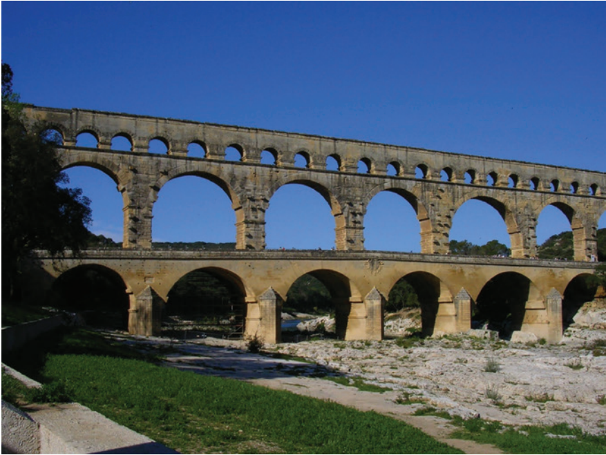
Figure 2.2 Roman Aqueducts (Cartwright, 2012).