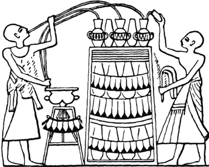
Figure 2.1 Drawings on the walls of Egyptian rulers Amenophis II and Rameses II (APEC Water, 2013).

of microbiological contamination risks in even clean-appearing water that led many to quench their thirst with wine or beer (Harris & Grigsby, 2009). In some ways, these actions were in response to results gleaned from the first microbiological sensors – gross observation of the impact contaminated water had on other people.