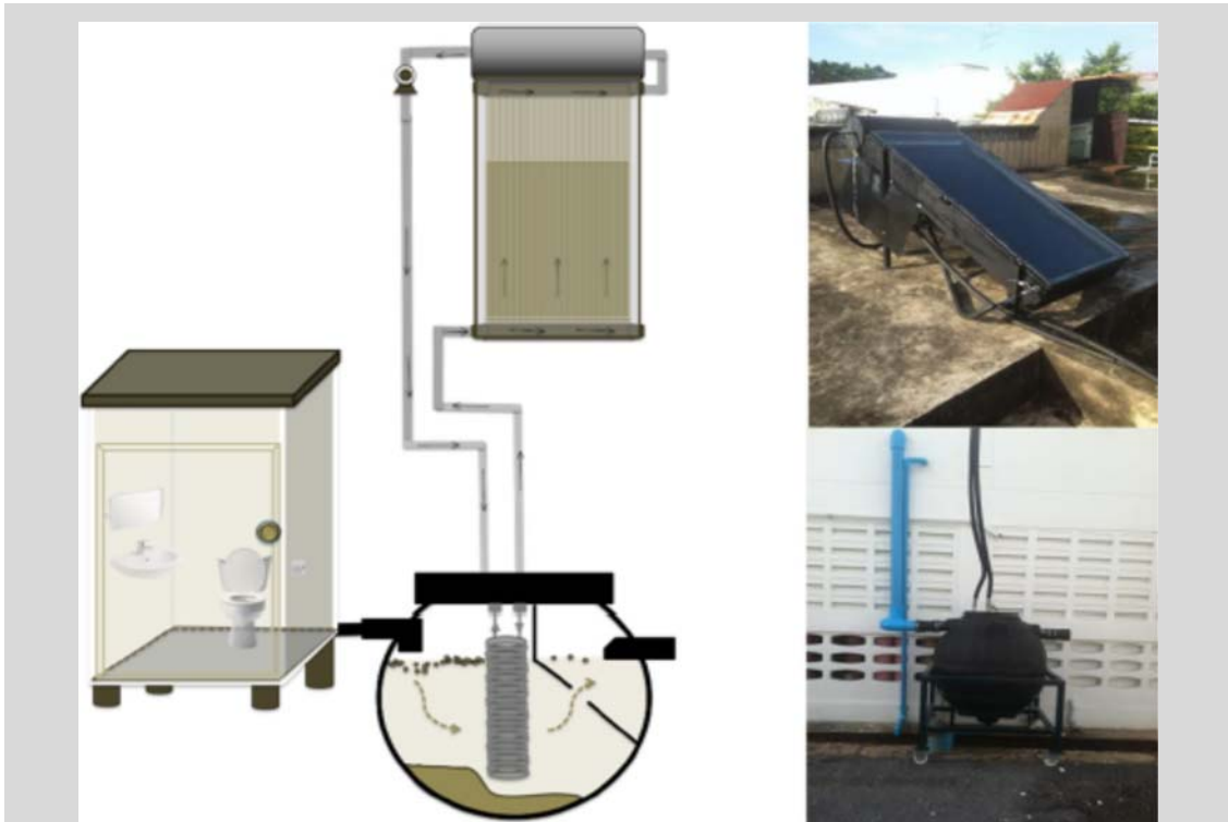
Figure 3.3 Field testing of the solar septic tank at the Asian Institute of Technology, Thailand (Source: AIT 2015).