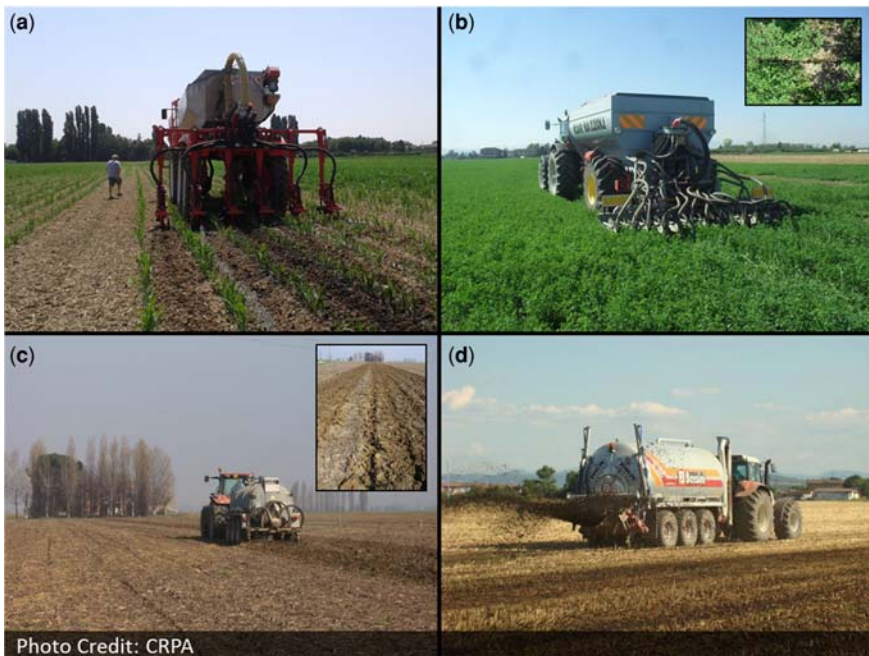
Figure 6.3 Digestate application methods: (A) trailing hose, (B) trailing shoe, (C) injection, and (D) splash plate.

The digestate liquid phase can be applied by means of devices used to spread raw sludge, and the digestate solid phase by means of the same devices used for solid manure application. Some devices are shown in Figure 6.3.