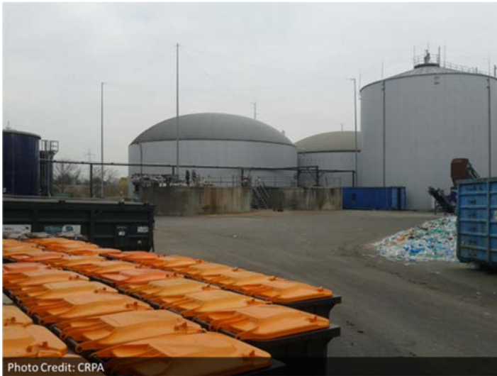
Figure 6.2 Waste biogas plant.

Waste BGP (Figure 6.2) are involved in the processing of biological degradable wastes (BDW). BDW is a raw material from various origins and substrate compositions, including the organic fraction of municipal wastes (OFMW), waste from the food industry, retail trade (expired food), certain agricultural waste, sludge from wastewater treatment plants, etc. (Usták et al. , 2004). The substrates used in these reactors exhibit non-homogeneous properties. Moreover, they can contain impurities, pathogens, trace metals, some organic pollutants and micro-organic pollutants which create waste management concerns. These concerns limit the potential uses of the digestate as a soil conditioner or fertilizer.