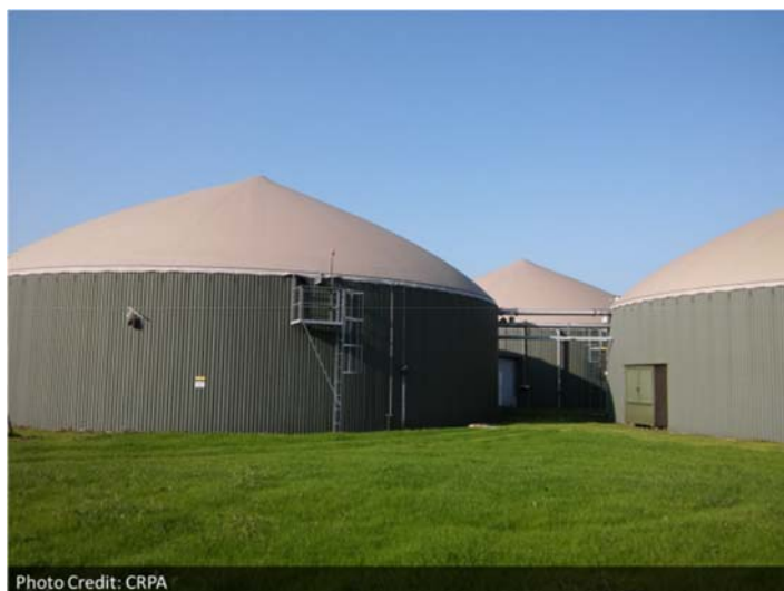
Figure 6.1 Agricultural biogas plant.

Agricultural BGPs (Figure 6.1) represented about 69% of the total BGPs in the European Union in 2015 (EBA, 2017). AD substrates from agricultural BGPs derived from livestock effluent (e.g., pigs, cows, horses, poultry slurries and manure), energy crops (e.g., maize, sorghum, triticale, other cereals, grasses, sugar beet), agricultural residues (e.g., straw, stovers) and agro-industrial by-products obtained from manufacturing agro-food sector (e.g., molasses, straw, stovers, olive pomace, tomatoes peel, vegetable and fruits manufacturing residues).