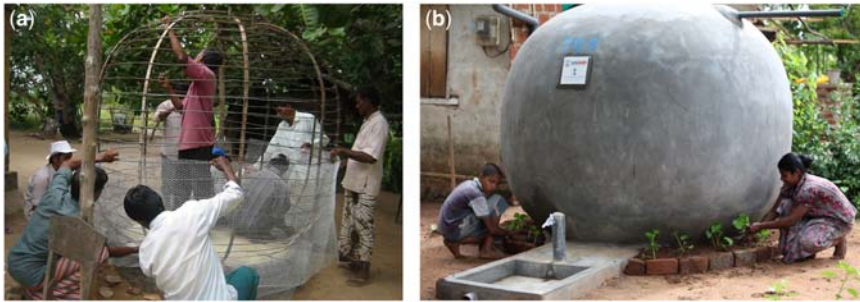
Figure 3.7 (a) Constructing a ferrocement pumpkin tank. (Source: LRWHF, s.f). (b) Finished ferrocement pumpkin tank. (Source: LRWHF, s.f).

1995, US$100). One tank made of ferrocement, has the shape of a pumpkin (Figure 3.7a, b) and is unique to the project. The second tank is built under ground and is an adaptation of the Chinese style biogas pit, using a simple, low cost technique to do the dome roof.