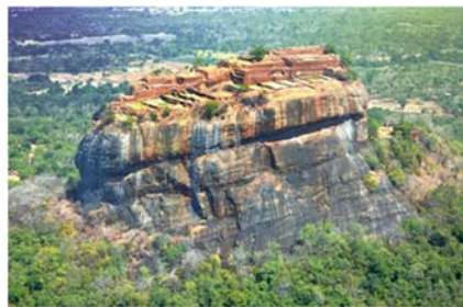
Figure 3.4 Sigiriya Rock Fortress.