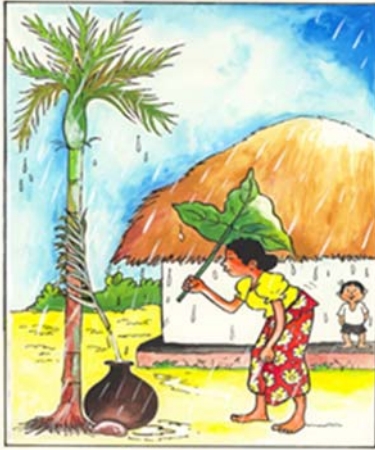
Figure 3.5 Rainwater collected from tree trunks.