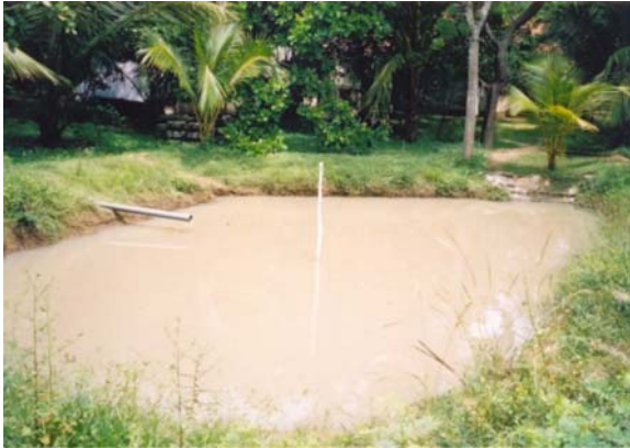
Figure 3.10 Garden pond or 'pathahas'. (Source: LRWHF, s.f).

Studies have shown that collection of runoff water can be used for agriculture as well as to improve the ground water levels both qualitatively and quantitatively. A study was carried out by LRWHF in Kurundamkulama (a village in Mihintale in Anuradhapura District to harvest/collect runoff rainwater in a 5 m 3 underground tank enabling the farmers to cultivate a crop during Yala (lesser rain season). As a result, the incomes of the families in the study area increased substantially (Weerasinghe et al. , 2005). Collection of runoff rainwater in this manner not only conserves water but also reduces soil erosion and degradation of the land.