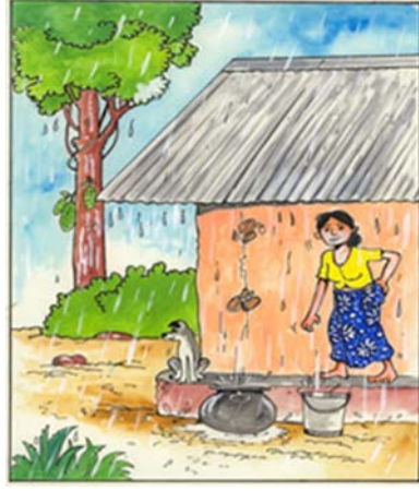
Figure 3.6 Rainwater collected from roof top into containers.

introduced rainwater harvesting as a water supply option in two wet zone districts Badulla and Matara. Since then, government and non-government organisations throughout the country have promoted the technology. There has been a significant increase in the use of roof water harvesting in Sri Lanka, which has proved to be a boon to rural people, particularly for domestic water supplies in water scarce situations. As a result, presently there are estimated 42,000 domestic rainwater systems which has brought much relief to households during times of drought, floods, tsunami, chronic kidney disease of unknown etiology and resettlement for many people living in rural areas.