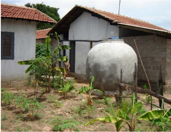
Figure 3.8 Home gardening with RWH.

The program has helped communities in the former northern conflict zone return to normalcy as quickly as possible through restoration of water sanitation and hygiene, food security and livelihoods.