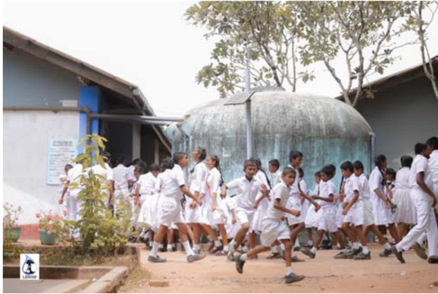
Figure 3.9 RWHS systems constructed in schools.

RWHS built in schools, which function as flood shelters, provide water to the people until government aid can reach them (Figure 3.9). Around 100 RWHS were constructed by LRWHF and maintaining groups are set up with students, teachers and parents as a sustainability measure. A manual for operation and maintenance of RWHS in schools was published by LRWHF with collaboration of PLAN SL and National Water Supply & Drainage Board to provide practical solutions and guidance for school teachers, parents, caretakers and students for operation and maintain RWHS to ensure long term sustainability.