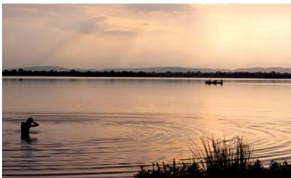
Figure 3.3 Tank or wewa in North central Province.

Over the last 25 years, traditional rainwater harvesting has been revived to address the acute water shortage experience due to temporal and spatial variation in rain fall and climate change disasters and many research studies were conducted to improve the technology. In 19995 Community Water Supply and Sanitation project initiated by government of Sri Lanka with World Bank funds