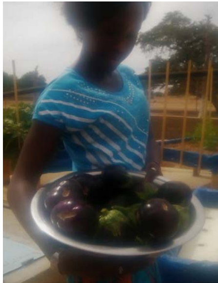
Figure 10.4 Eggplant harvest after 2.5 months. (S.Sene, 2018).

Growing crops such as tomatoes considerably increased the revenue of project beneficiaries. As an example, in the village of Walalane, where market gardening was conducted in fields, and irrigated using the above-mentioned restored water tank, 604 kg of tomatoes were harvested from a 100 m 2 parcel of land and sold for 22,500 Fcfa (343 euros). This money was used by the five, female project beneficiaries, to improve the quality of the food they bought for their families, by buying seasonings and spices and additional food stuffs.