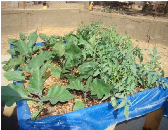
Figure 10.3 Development state of tomato and eggplants. (S.Sene, 2018).

Additionally, as a result of the variety of vegetables that were harvested (salads, carrots, turnips, okra, sweet and bitter aubergines, and tomatoes) the project beneficiaries were able to improve the nutritional value and diversity of their meals during at least three months. The beneficiaries' households had never previously been able to grow or consume these vegetables out of season, and, with regard to carrots and turnips in particular, certainly never in the volumes produced by the project.