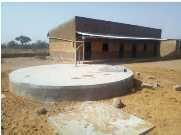
Figure 10.2 Rainwater harvesting system in Dekhaye School. (S.Sene, 2018).

The reservoirs constructed for this project (Figure 10.2) were partially buried, with 2 m of the structure located below-ground and 0.5 m protruding above ground. These tanks collected water from the roofs, using corrugated iron or aluminium gutters, at the end of which a funnel covered with a metal mesh was attached. This semi-permeable barrier performed a initial filtering of the rainwaters before they ran, via a PVC pipe, into the rainwater reservoir or cistern.