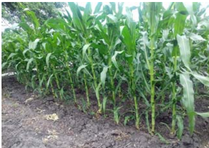
Figure 11.15 Maize under residual moisture.

These FBFS serve crop production, fishery, livestock, and are the sustenance of local ecological systems. Dependent on flood events, they are prone to climate change, yet they have considerable unused economic potential, as can be seen