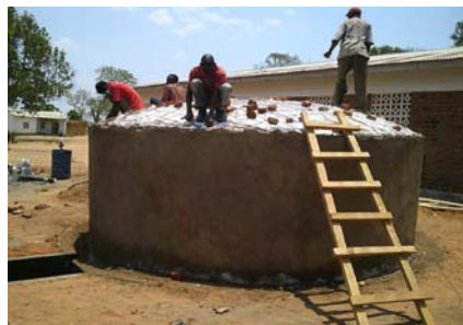
Figure 11.5 Ferro-cement tank under construction.