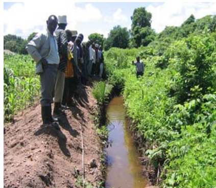
Figure 11.14 Infiltration pits, Karonga District.