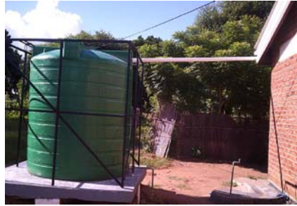
Figure 11.3 Plastic tanks for rainwater harvesting, Balaka District. (Source: Author's own).

plastic tanks (Figures 11.3–11.5). To date over 500 above ground tanks have been constructed for roof-top water harvesting across the country.