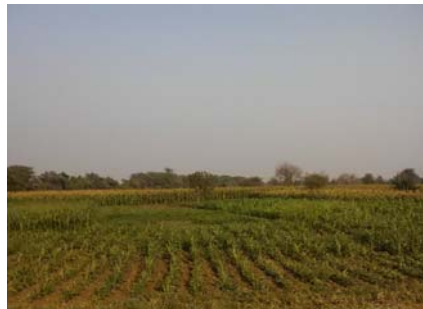
Figure 11.16 Previously flooded fields planted with Maize.