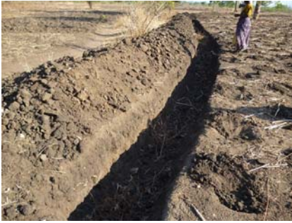
Figure 11.11 Infiltration pit, Neno District.