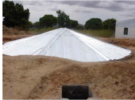
Figure 11.7 Underground tank (150,000 liters).

of over 50 Underground tanks in the early 2000 which were used for agriculture production using Drip Irrigation. However, poor maintenance has rendered most of these underground tanks unusable. There has been lack of ownership of these tanks with communities expecting the donor to maintain the tanks for them.