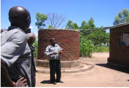
Figure 11.2 Above ground brick tank, Karonga District. (Source: Author's own).