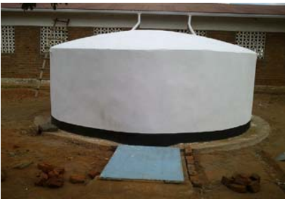
Figure 11.4 30,000 L ferro-cement tank Kasungu District.

Concrete lined underground tanks have mostly been built to collect runoff from ground surfaces e.g., school grounds, hill sides and road runoff (Figures 11.6 and Figures 11.7). The water from underground tanks is mostly used for cleaning, watering livestock and tree nurseries for afforestation. The Irrigation Rural Livelihood and Agriculture Development Programme facilitated the construction