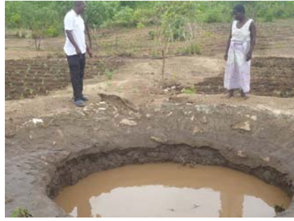
Figure 11.12 Percolation pond, Neno District.

In Liwonde Village, Neno District, rainwater stored in the ponds and hand dug wells is used productively in watering vegetables and fruit trees. Farmers are growing different vegetables (Chinese lettuce, mustard and tomatoes) in their fields that are recharged using in-situ techniques. The vegetables are growing well and are able to be used as a source income for the households. The success of in-situ techniques is attributed to the fact that they are cheap and easy to implement. Due to the huge potential of scaling up these in-situ techniques, more efforts have been devoted to capacity building of communities to enable effective implementation. The structures are continually monitored so that some minor maintenance is done by individual land owners. Implementation of in-situ techniques is achieved in clusters formed by the farmers. Choice of sites for