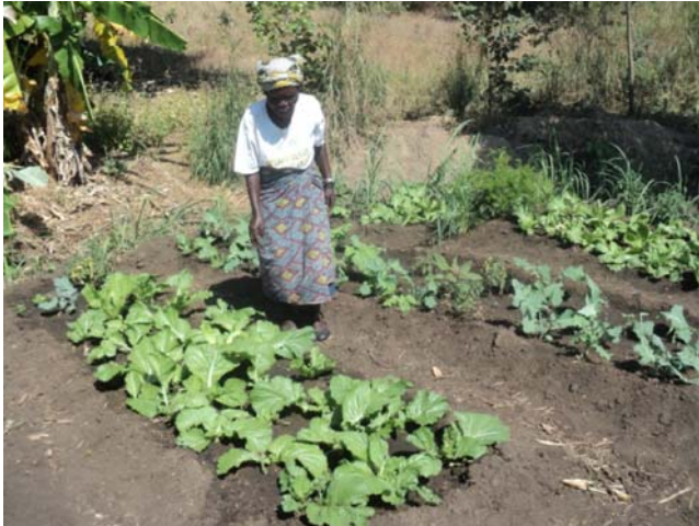
Figure 11.17 A woman managing her vegetable garden, Balaka District..

communities, no incentives or subsidies will be required for them to take remedial measures.