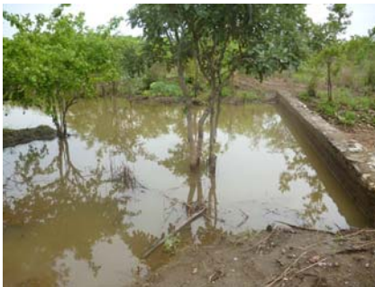
Figure 11.8 Water harvesting small dam, Senzani, Ntcheu.

The history of dam construction for rainwater harvesting dates back to the mid-1940s when the colonial government formulated an irrigation policy with the primary objective of reinforcing water and soil conservation (Nthara et al. , 2008).