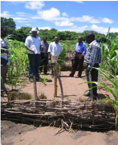
Figure 11.13 Check-dams, Karonga District.

In Liwonde Village, Neno District, rainwater stored in the ponds and hand dug wells is used productively in watering vegetables and fruit trees. Farmers are growing different vegetables (Chinese lettuce, mustard and tomatoes) in their fields that are recharged using in-situ techniques. The vegetables are growing well and are able to be used as a source income for the households. The success of in-situ techniques is attributed to the fact that they are cheap and easy to implement. Due to the huge potential of scaling up these in-situ techniques, more efforts have been devoted to capacity building of communities to enable effective implementation. The structures are continually monitored so that some minor maintenance is done by individual land owners. Implementation of in-situ techniques is achieved in clusters formed by the farmers. Choice of sites for