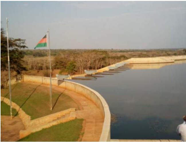
Figure 11.10 Communally owned earth dam, Chitsime EPA, Lilongwe district.

The colonial government constructed small dams as a conservation strategy and also as a source of water for the urban populace as well as for livestock Njoloma (2011) ( Figure 11.10 ). Irrigation around small dams was an ‘informal trend’ that progressively developed either downstream or upstream of the dams. Between 1950 and 1980, the government of Malawi facilitated the construction of over 600 dams across the country ( Figure 11.10 ). The dams were used for irrigation farming but some also supported livestock production and other activities. Due to land degradation, most of these dams are no longer functional as a result of siltation and lack of maintenance. Of late, there have been a number of projects that have constructed run off detention weirs for retaining surface run off ( Figures 11.8 and 11.9 ). However siltation remains a major challenge for these structures requiring farmers to routinely de-silt them.