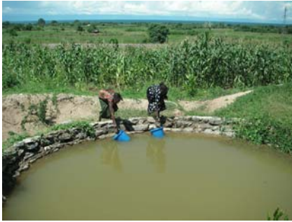
Figure 11.6 Underground tank, Karonga District.