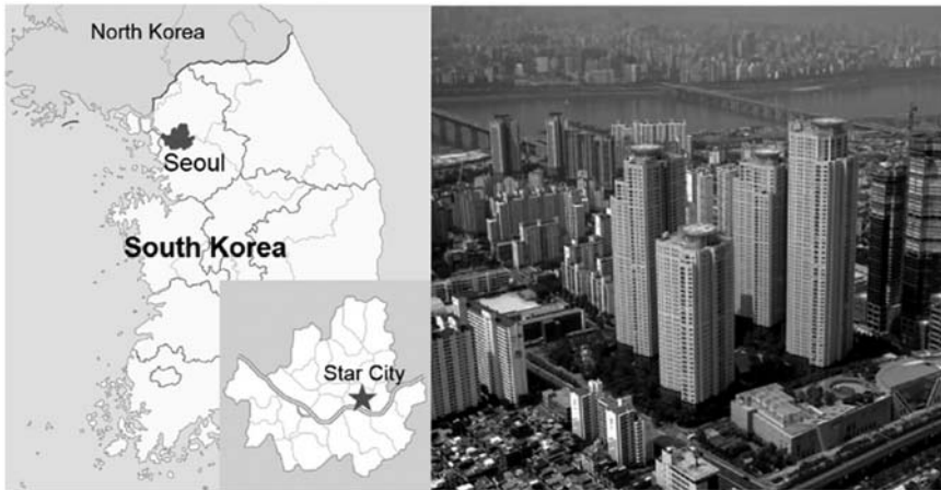
Figure 13.1 Location of star city in Korea. (Source: Author's own).

Han and Nguyen (2018) emphasized that the special features of Star City RWMS are: (1) the concept of multi-purpose system; (2) the proactive management of flooding; and (3) the city government incentive program.