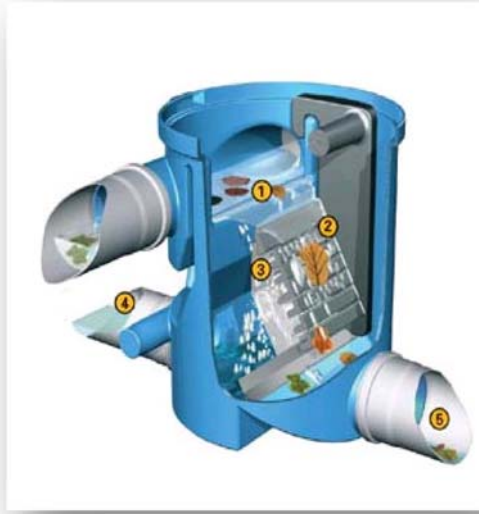
Figure 14.3 Mechanical roof wash device. (Courtesy: Graf Corporation).

slightly negative pH and the absorption of minerals. Suitable materials for rainwater storage are concrete and plastic.