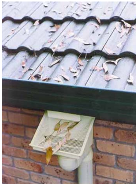
Figure 14.1 Leaf Eater Debris Excluder. (Courtesy: Rain Harvest Systems).

A first flush device, that wastes the first part of a rain event, is beneficial to reduce the accumulated dirt and debris from the roof from entering the cistern. The First Flush Volume necessary to be wasted is dependent up on the site conditions and level of contaminants likely to be found on the roof (Figure 14.2).