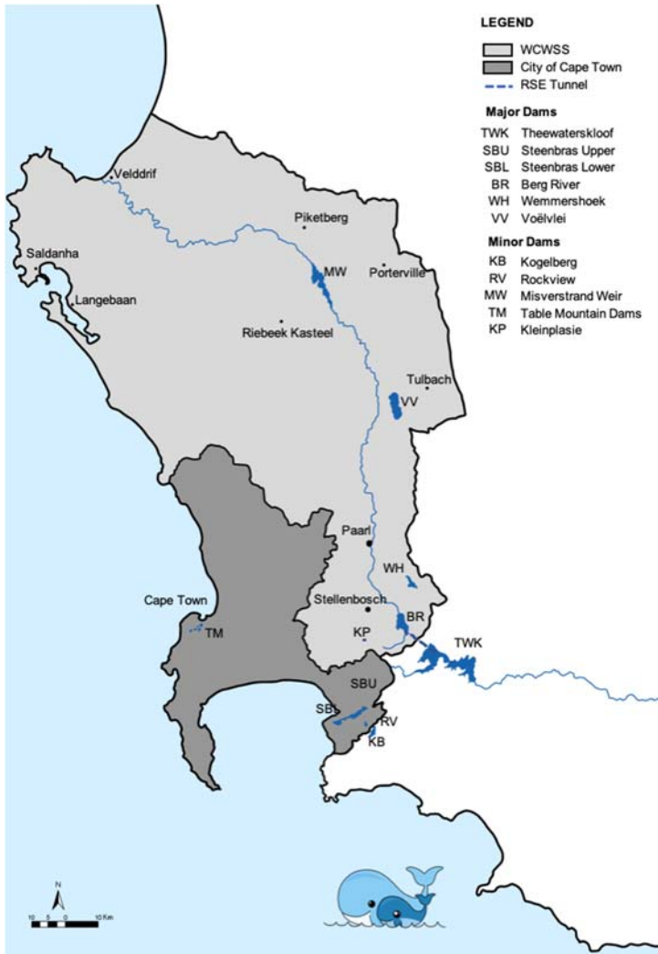
Figure 2.1 The WCWSS and dams.