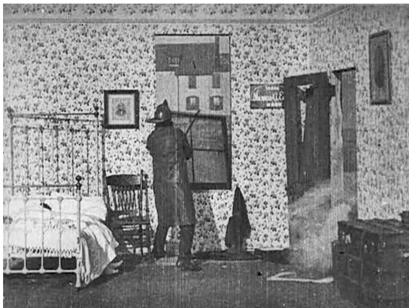
Figure 2 The rescuer breaks the window. Frame enlargement of shot 8, Life of an American Fireman , Edison Manufacturing Company, 1902–03. Printed with permission from disc 1 of Edison: The Invention of the Movies , Kino International, 2005.

stage exits suggests a different way the new medium of cinema could move bodies through space. 24