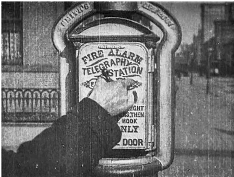
Figure 4 Opening the door to sound the alarm. Frame enlargement of shot 2, Life of an American Fireman , Edison Manufacturing Company, 1902–03.

In a superb recent discussion of Life of an American Fireman , Paul Young demonstrates the profound significance of the insertion of the alarm: