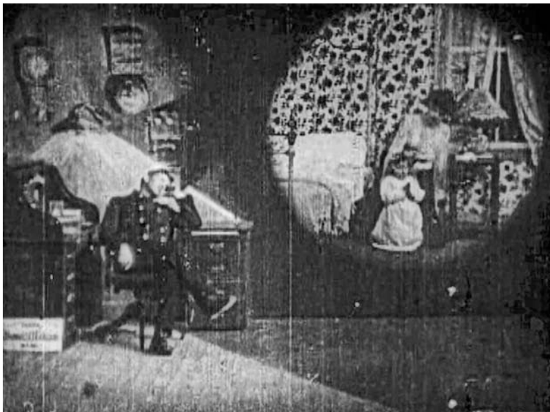
Figure 3 The fireman's dream. Frame enlargement of shot 1, Life of an American Fireman , Edison Manufacturing Company, 1902–03. Printed with permission from disc 1 of Edison: The Invention of the Movies , Kino International, 2005.

emphasizes the rapidity of the firefighting apparatus (whose aroused firemen don “their clothes in the record time of five seconds” and whose horses “are hitched in the almost unbelievable time of five seconds” [EC-BN, 216]), Life of an American Fireman visually appears to harken back to the prior medium of magic-lantern slide shows whose “well-developed spatial constructions” lead to action that is “retarded, repeated,” as Musser asserts (BN, 226). But at the same time, by dwelling on portals between spaces otherwise seemingly self-contained, the film opens up new possibilities for the fledgling medium of cinema.