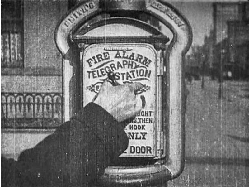
Figure 4 Opening the door to sound the alarm. Frame enlargement of shot 2, Life of an American Fireman , Edison Manufacturing Company, 1902–03. Printed with permission from disc 1 of Edison: The Invention of the Movies , Kino International, 2005.

In a superb recent discussion of Life of an American Fireman , Paul Young demonstrates the profound significance of the insertion of the alarm: