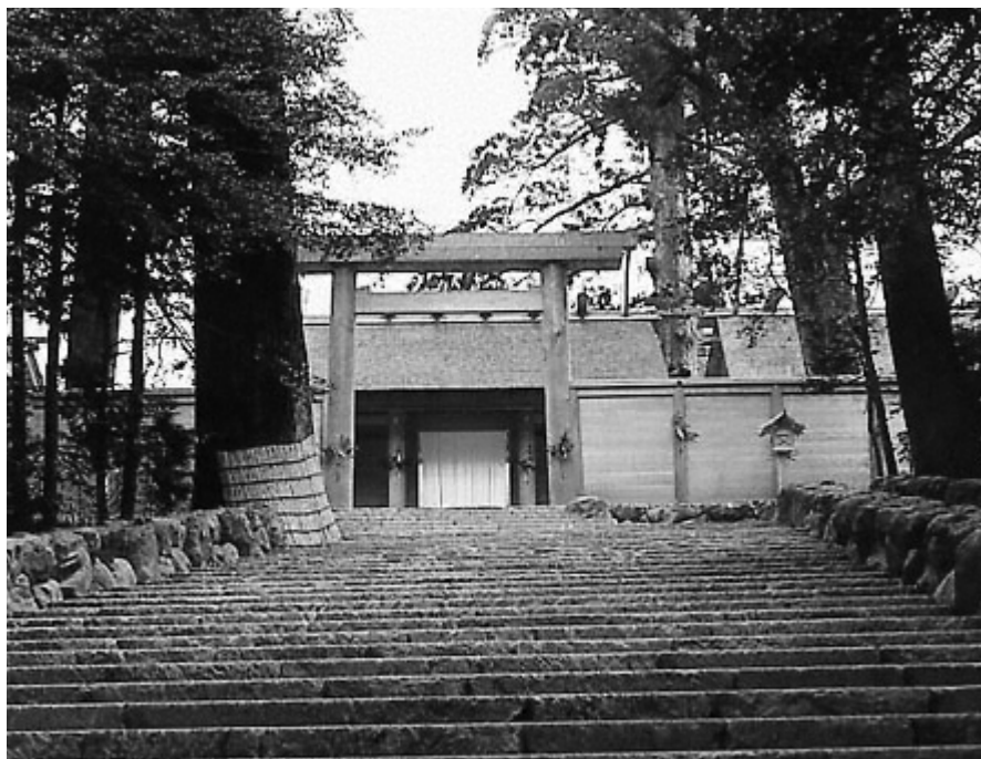
Figure 3. First fence, with main gate, surrounding the shōden , inner precinct of the enshrined kami Amaterasu at Ise.

There have been sixty-one such unbuildings and rebuildings, historically verifiable, over the past 1,300 years, and the official line of Shinto is that this ritual has been going on for about two millennia, ever since the kami left the emperor's palace at Yamato and found a home that she preferred in Ise. Since that time, her residence has been the small shōden in Ise's most sacred inner precinct, which is enclosed by four rows of fences, beyond even the first of which only descendants of Amaterasu are admitted, bearing gifts (fig. 3).