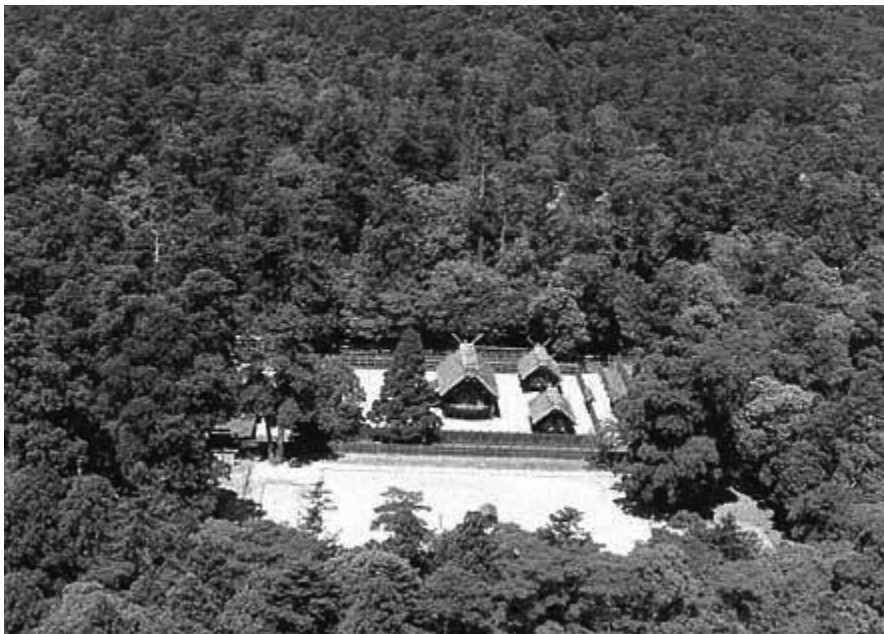
Figure 5. Aerial view of the “divine forest” surrounding Ise Jingū, Mie prefecture.

shrines have yet another vital quality, which is entirely original in its effect, intention, and perception. This is the fact that the shrines are always new. 8