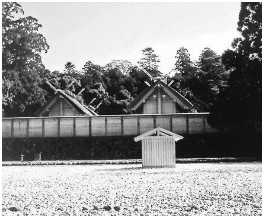
Figure 2. Kodenchi , empty site for the reconstruction of Ise shrines immediately adjacent.

Shinto and Japan. In the ritual of shikinen sengu , the sixty-some shrine buildings of Ise (as well as the Uji Bridge leading to them over the Isuzu River) are demolished, then rebuilt, exactly, to the last detail, on the kodenchi , the vacated site of the last disassembled shrine (fig. 2). As Arata Isozaki, known for masterpieces of architecture in the West as well as in Japan, explains the procedure: