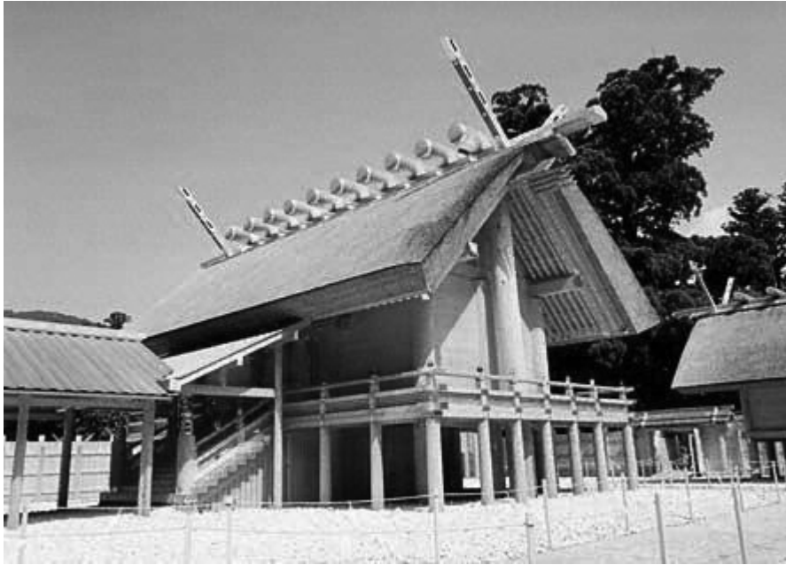
Figure 4. Detail of roof construction and balustrade, main sanctuary, Ise.

hardware (fig. 4). 7 These characteristics have had incalculable effect on the way the Japanese have built their buildings for many centuries—though it is forbidden to reproduce the Ise style of architecture elsewhere and, besides, only the imperial elite and their carpenters know how the insides of the buildings look.