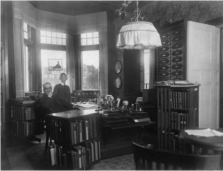
Figure 1. Aby Warburg and his son Max Adolph in Warburg's study in Hamburg.

as on that of art. Lecture series and collaborative projects stitched intellectual webs across the landscape of Europe.