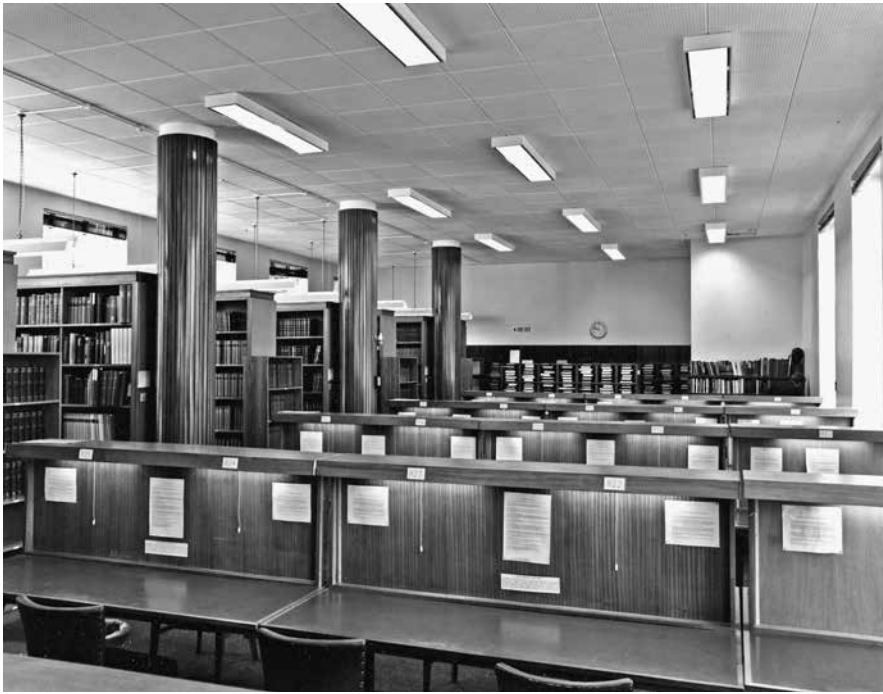
Figure 3. The Reading Room of the Warburg Institute in Woburn Square, London, 1999.