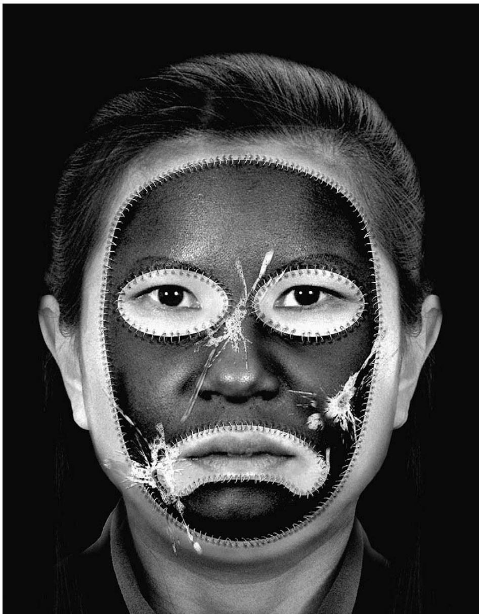
From Colour Separation (Mongrel, 1997).