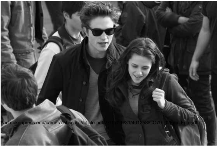
Figure 47. Bella and Edward walk blissfully on campus like a pair of movie stars in Twilight. Shown from left: Robert Pattinson, Kristen Stewart.