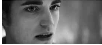
Figure 19. Setup 7a