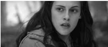
Figure 22. Setup 9

Notice that the visual structure of the sequence is organized around setup 2 and its variations, including setup 7. In fact, setup 7 is shot from the exact camera position as in setup 2, where the frame now only includes Edward's face. The logic of its construction can be understood as what Bordwell calls "serial poetics": a shot-by-shot order that is not based on narrative cause and effect, but on a conscious mathematical repetition of shots and variations. 40 Such organization lacks any committed visual point of view. Instead, the spectators are confronted by the totality of the camera's consciousness. The result is a narrative suspension, and we are supposed to be liberated (though, arguably, the sequence does not actually succeed) from the sequence of narrative events that came before this, and will soon come after, and thus able to focus on the image itself as a discourse. In this light, the narrative of the vampire is serially disintegrated by its visual structure as a pretext that allows us to satiate our fascination with the image and to satisfy our craving for the image of Pattinson and the fort-da structure of desire that he represents.