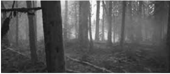
Figure 6. Setup 1