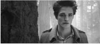
Figure 8. Setup 3