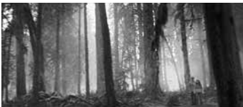
Figure 16. Setup 6