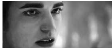
Figure 17. Setup 7