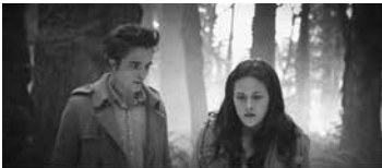
Figure 14. Setup 5