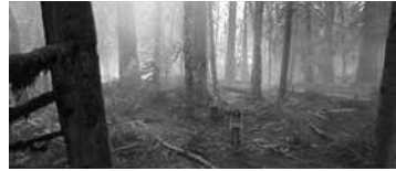
Figure 9. Setup 1a