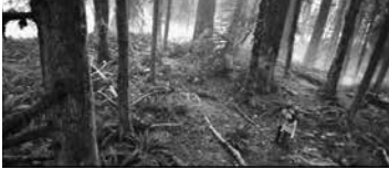
Figure 20. Setup 1a