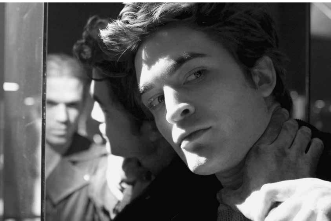
Figure 1. Robert Pattinson (right) in Twilight (dir. Catherine Hardwicke, US, 2008).