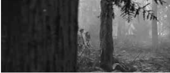
Figure 12. Setup 4