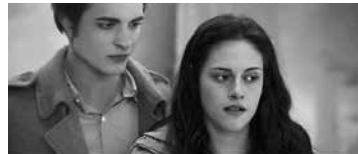
Figure 15. Setup 2b.3