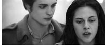
Figure 21. Setup 2b.4