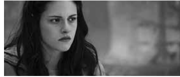
Figure 7. Setup 2