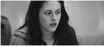
Figure 10. Setup 2a