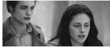
Figure 11. Setup 2b.1