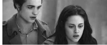
Figure 13. Setup 2b.2