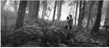
Figure 18. Setup 8