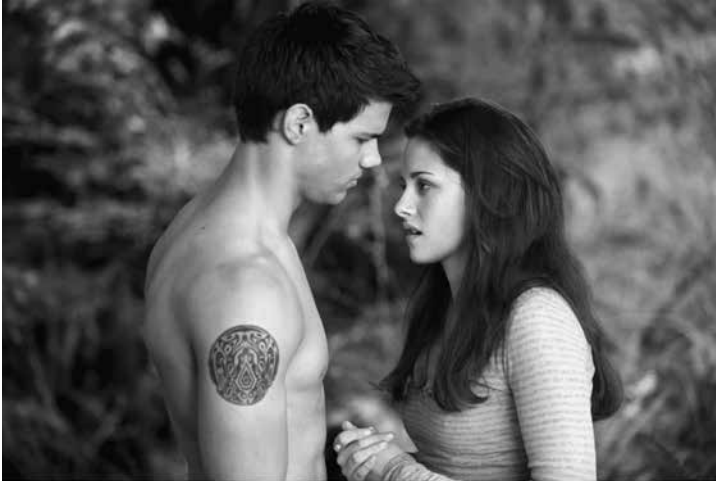
Figure 5. Bella looks lustfully at Jacob's body. The Twilight Saga: New Moon (dir. Chris Weitz, US, 2009). Shown from left: Taylor Lautner, Kristen Stewart.

to someone with a condition that is deliberately altered and balanced by drug use. Because of these features, he is desirable yet unapproachable. 30 In contrast, available sexuality in the franchise is then displaced onto the muscular and implicitly hypersexualized “hot” body of Taylor Lautner’s character Jacob Black. Jacob is literally hot in the narrative from the second installment on, for Jacob is turned into a werewolf and, during his off-time, a full-bodied young man who generates excessive body heat and hence does not need to be clothed. 31 In New Moon , for example, scenes of Jacob and Bella often feature a lustful Bella looking fixatedly at Jacob’s body (fig. 5). In fact, Bella’s lust (or love) for Jacob is poorly articulated in narrative terms; rather, the spectators are expected to understand Bella’s desire simply by her lustful look, the sexual energy carried by Jacob’s hyper-perfected body, his otherness as a Quileute young man, and Jacob’s other identity as a werewolf. Not only that desire is othered; Jacob is also narratively structured as Edward’s double in a way that Jacob too must refrain from having sex with Bella because he may turn into an animal and hurt her. 32