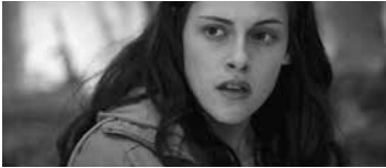
Figure 22. Setup 9

Notice that the visual structure of the sequence is organized around setup 2 and its variations, including setup 7. In fact, setup 7 is shot from the exact camera position as in setup 2, where the frame now only includes Edward's face. The logic of its construction can be understood as what Bordwell calls "serial poetics": a shot-by-shot order that is not based on narrative cause and effect, but on a conscious mathematical repetition of shots and variations. 40 Such organization lacks any committed visual point of view. Instead, the spectators are confronted by the totality of the camera's consciousness. The result is a narrative suspension, and we are supposed to be liberated (though, arguably, the sequence does not actually succeed) from the sequence of narrative events that came before this, and will soon come after, and thus able to focus on the image itself as a discourse. In this light, the narrative of the vampire is serially disintegrated by its visual structure as a pretext that allows us to satiate our fascination with the image and to satisfy our craving for the image of Pattinson and the fort-da structure of desire that he represents.