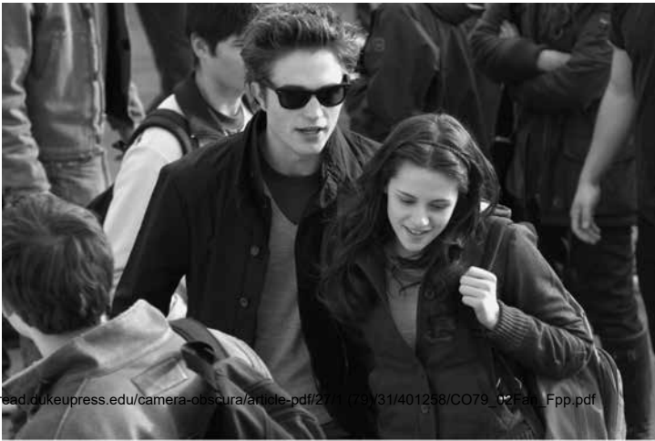
Figure 47. Bella and Edward walk blissfully on campus like a pair of movie stars in Twilight. Shown from left: Robert Pattinson, Kristen Stewart.