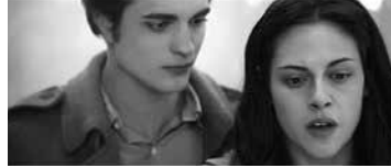
Figure 21. Setup 2b.4