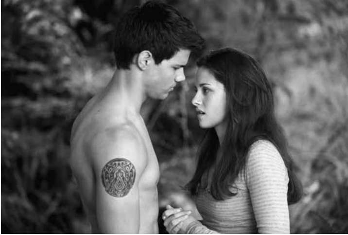
Figure 5. Bella looks lustfully at Jacob's body. The Twilight Saga: New Moon (dir. Chris Weitz, US, 2009). Shown from left: Taylor Lautner, Kristen Stewart.

to someone with a condition that is deliberately altered and balanced by drug use. Because of these features, he is desirable yet unapproachable. 30 In contrast, available sexuality in the franchise is then displaced onto the muscular and implicitly hypersexualized “hot” body of Taylor Lautner’s character Jacob Black. Jacob is literally hot in the narrative from the second installment on, for Jacob is turned into a werewolf and, during his off-time, a full-bodied young man who generates excessive body heat and hence does not need to be clothed. 31 In New Moon , for example, scenes of Jacob and Bella often feature a lustful Bella looking fixatedly at Jacob’s body (fig. 5). In fact, Bella’s lust (or love) for Jacob is poorly articulated in narrative terms; rather, the spectators are expected to understand Bella’s desire simply by her lustful look, the sexual energy carried by Jacob’s hyper-perfected body, his otherness as a Quileute young man, and Jacob’s other identity as a werewolf. Not only that desire is othered; Jacob is also narratively structured as Edward’s double in a way that Jacob too must refrain from having sex with Bella because he may turn into an animal and hurt her. 32