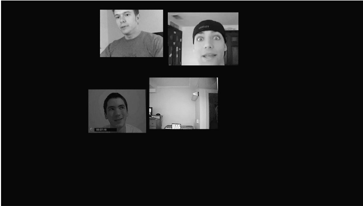
Figure 3. I Am Not (dir. Natalie Bookchin, US, 2009), part of Bookchin's Testament series. The central position of the image of an open laptop on a bed in an empty room through much of the piece signals the new hybrid public-private space of the Internet.

tion and much miscommunication (fig. 3). In this piece, Bookchin has collected clusters of expression that people have posted online regarding whether or not they are gay, a seemingly unconventional way to communicate personal information to an unknown public. When numerous people declare that they are not gay, they seem to be trying to clear their name in some sort of public way. A white teenager with short hair and playful eyes underneath dark bushy eyebrows who wears a white T-shirt begins the piece with the ambiguous statement, “For those of you who doubt I am straight. . . . For those of you who don’t know, I haven’t always been straight.” He laughs, presumably at his revelation, and then his image stays frozen in his frame while a new frame opens to his right. In the new frame, a young black man with short hair wearing a green T-shirt turns on his camera and, with a dismissive look, walks away, revealing a laptop that sits open on a bed for the rest of the piece. Meanwhile, a number of images of other people emphatically insisting on clarifying their sexuality emerge erratically around the frame (as opposed to the straight rows of My Meds ). Their comments are not synchronized, but they are clearly responding to the same set of social discourses: “I was gay, but I’m not anymore,” “It’s okay to be