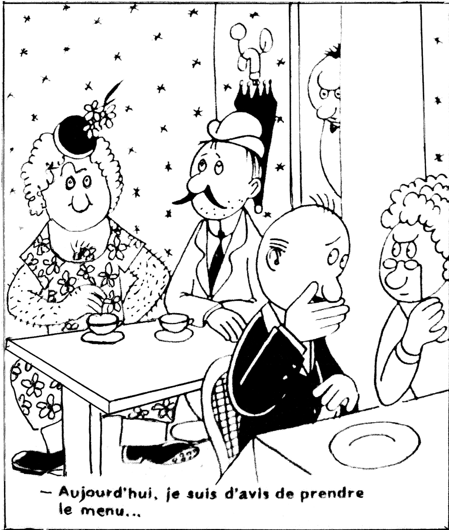
Figure 1 “Today, I’d advise sticking to the regular menu.” Devant le marché noir (Paris, 1943)

could catch only one or the other category of offense. By sudden entry into a restaurant they could catch some offenses in the act, but evidence was needed for the menus offered, the quantities of food served, and the prices charged at the end of the meal. The full range of offenses could be observed and punished only if the controller was present as a seemingly legitimate customer during the entire meal (fig. 1).