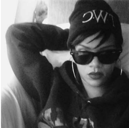
Figure 1 Selfie by Rihanna (@badgirlriri)

ences for all types of digital content. The ability to replicate digital photographs, the integration of cameras into mobile phones, and the popularity of sites like Flickr, Imgur, Facebook, and Instagram facilitate and encourage sharing photos with others. Facebook has more than 250 billion photos, and 350 million more are uploaded every day (Wagner 2013) in order to be seen by an audience whose comments, likes, and “shares” function as social currency and social reinforcement.