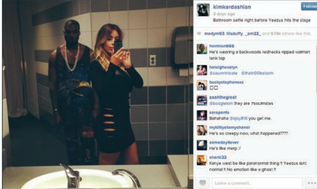
Figure 3 Bathroom selfie by Kim Kardashian (@kimkardashian)

ting; and extratextual information about Kardashian and West themselves, who are extremely famous both individually and as a couple. Although the photo's 678,000 likes and multiple negative comments may also contribute to viewers' interpretations, the Instagram software makes user photos the central form of identity expression.