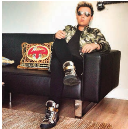
Figure 8 Selfie by @kanelk_k

While Lim may have an immense amount of consumer goods, how he came to have such riches is not immediately obvious to his followers, who are presumably not as wealthy. A photo of Lim’s extraordinary Louboutin collection (see fig. 9) is