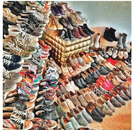
Figure 9 Kane Lim’s shoe collection by @kanelk_k