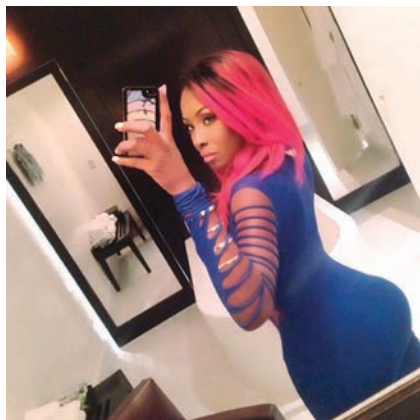
Figure 6 Selfie by @leleboo_phucku