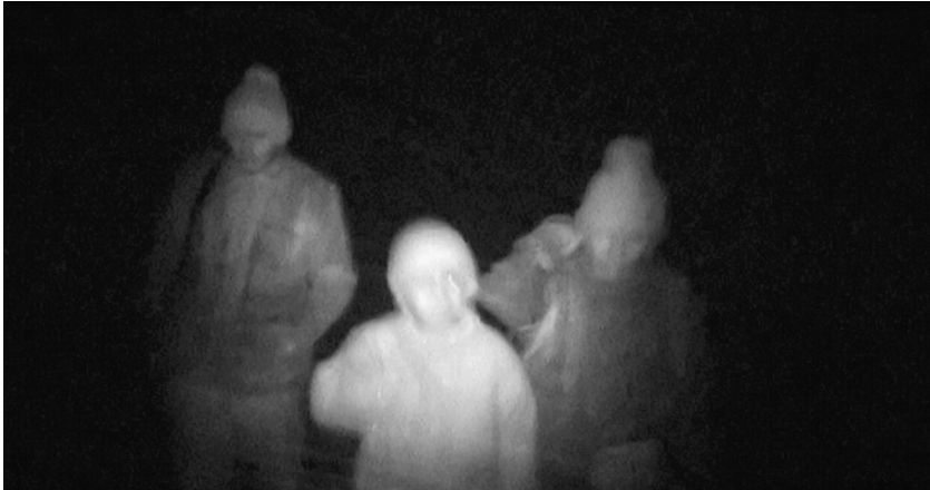
Figure 3. Crossing the mountains. From In This World (dir. Michael Winterbottom, 2002).

the new surveillance technologies whose purpose is to bring hidden labor migration into plain sight. The technical limitations of digital video repeat the aesthetics of surveillance in rendering the human figure only partially visible, but they also invert the significance of these aesthetics. By filming in darkness Winterbottom reverses the effect of the technologies of surveillance by making the discernible body less visible. In doing so, he uses the limitations of video to draw attention to the policing of the border, which requires a surreptitious representation of the transgressive migrating body. This is given added poignancy by the fact that the narrative rationale for the scene is the characters' attempt to evade the technologies of surveillance. The ghostly appearance of the actors is both aesthetically and structurally connected to a more general representation of embodied labor as revenant, whose return is an indictment of the systems of exchange and mobility within a global free-trade economy.