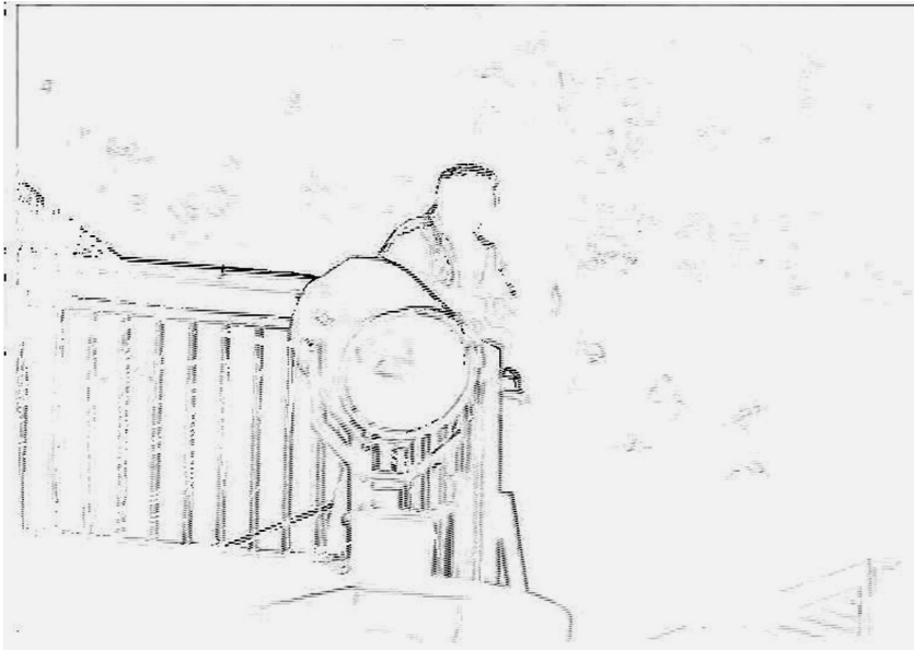
Figure 5. Melanie Jackson, The Undesirables , 2007, animated digital video. Footage from the docks at Bristol, Plymouth, and Southampton with degraded visual field to comply with border security. Copyright Melanie Jackson, reproduced with permission

surveillance imagery. Yet it finds its twin in the visual field of the animation, which is characterized by what it cannot show rather than what is actively shown. Jackson was permitted to film in the dock area if she agreed not to use the images that she acquired. In seeking to find a means to make her footage useable she produced an animated film which has radically degraded the visual field. The result of her manipulations of the images is a visual frame that is almost wholly blank. Most of the frames comprise a white screen with rough outlines of the objects being depicted (see fig. 5). Much of what is shown here are trucks being surveyed using the sophisticated electronic equipment designed to detect the presence of illegalized migrants. Jackson's representation of the scanning of the vehicles resembles the kinds of images that this technology produces; delivering visual phantoms which exist at the limits of what is perceptible. When Jackson showed the film to officials in the docks they commented upon its similarity to the images produced by x-ray scanners that are used for dock surveillance.