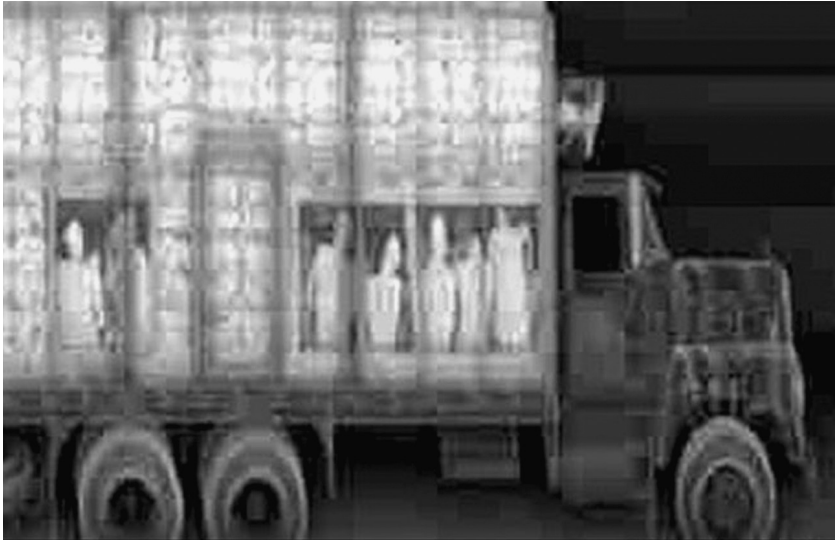
Figure 1. Migrants hiding inside a truck photographed by x-ray surveillance equipment.

themselves inhabit a boundary between object and subject; they are both curiously bodily, stripped of clothing and hair, yet also ghostlike in ways that suggest their dematerialization. The poor quality of the image used by the Metropolitan Police results in a rough pixilation and tonal homogeneity which seems to superimpose the bodies and the freight upon each other so that the people in the picture form a haunting return of embodied labor imbricated into labor in its commoditized form.