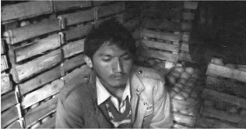
Figure 2. Enayat hidden. From In This World (dir. Michael Winterbottom, 2002).

and Iran. Such difficulties partly shape the images that the film is able to include and contribute to its symbolic language. For instance, the use of handheld cameras exaggerates a sense of motion which is arguably fitting for representing the modern migrant who is defined by movement rather than any clear state of belonging. Similarly, the film frequently uses only found light, so that many of the images, such as in a scene where two migrants travel in the undercarriage of a goods truck through the Channel Tunnel from France to England, are dependent upon the light produced by the infrastructures of modern travel. Such scenes emphasize the technological limitations on any attempt to visually capture undocumented workers and implicitly reference the technical problems which the new x-ray technologies seek to resolve.