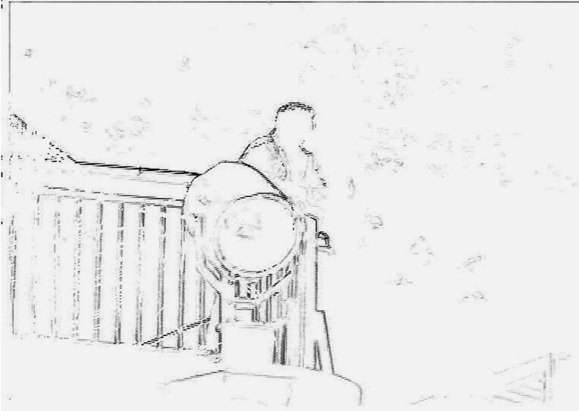
Figure 5. Melanie Jackson, The Undesirables , 2007, animated digital video. Footage from the docks at Bristol, Plymouth, and Southampton with degraded visual field to comply with border security.

surveillance imagery. Yet it finds its twin in the visual field of the animation, which is characterized by what it cannot show rather than what is actively shown. Jackson was permitted to film in the dock area if she agreed not to use the images that she acquired. In seeking to find a means to make her footage useable she produced an animated film which has radically degraded the visual field. The result of her manipulations of the images is a visual frame that is almost wholly blank. Most of the frames comprise a white screen with rough outlines of the objects being depicted (see fig. 5). Much of what is shown here are trucks being surveyed using the sophisticated electronic equipment designed to detect the presence of illegalized migrants. Jackson's representation of the scanning of the vehicles resembles the kinds of images that this technology produces; delivering visual phantoms which exist at the limits of what is perceptible. When Jackson showed the film to officials in the docks they commented upon its similarity to the images produced by x-ray scanners that are used for dock surveillance.