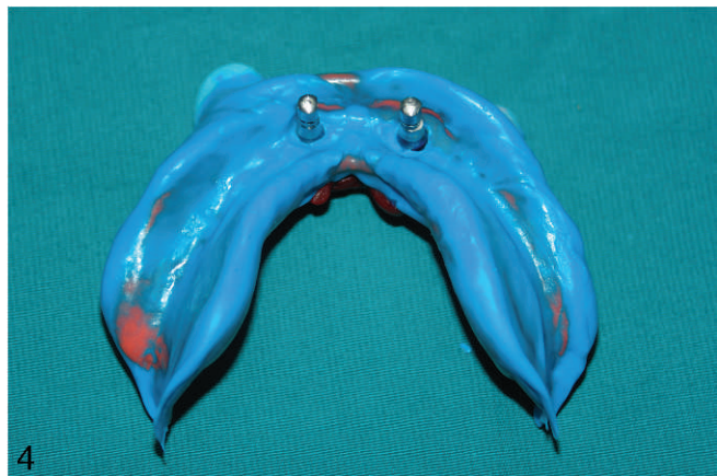
FIGURES 1–4. FIGURE 1. Implant impression copings screwed onto implants. FIGURE 2. Functional impression of the mandibular arch. FIGURE 3. Impression copings held rigidly by the tray with the help of autopolymerizing acrylic resin. FIGURE 4. Definitive impression of the mandibular arch.