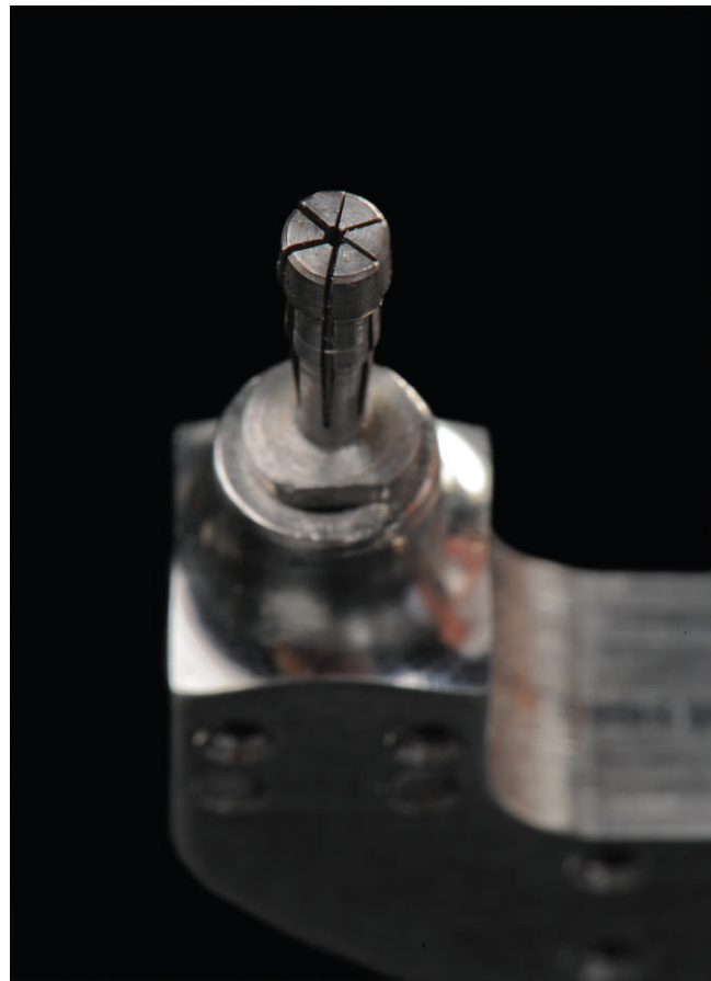
FIGURE 1. Sensing element of the BoneProbe consisting of a metal cylinder with a diameter of 3.5 mm, which is split into 6 segments. The sensor can be positioned in an implant socket and expanded while the actual force needed is measured.