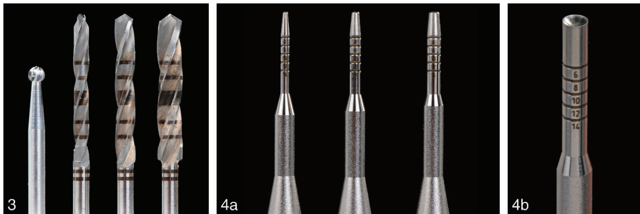
FIGURES 3 AND 4. FIGURE 3. Set of drills used for conventional implant bed preparation. A round burr is used to mark the implant position prior to the creation of an osteotomy using twist drills with diameters ranging from 2.2 mm to 3.5 mm. FIGURE 4. (a) Set of bone condensing osteotomes used for nonablative implant bed preparation following the creation of an initial osteotomy with a diameter of 2.2 mm. (b) Sinus lift osteotome with concave end, which was used for final shaping of the implant sockets.

as test statistic. The level of significance was set at \alpha = 0.05 . In addition, Pearson correlation coefficients were calculated for all combinations of parameters.