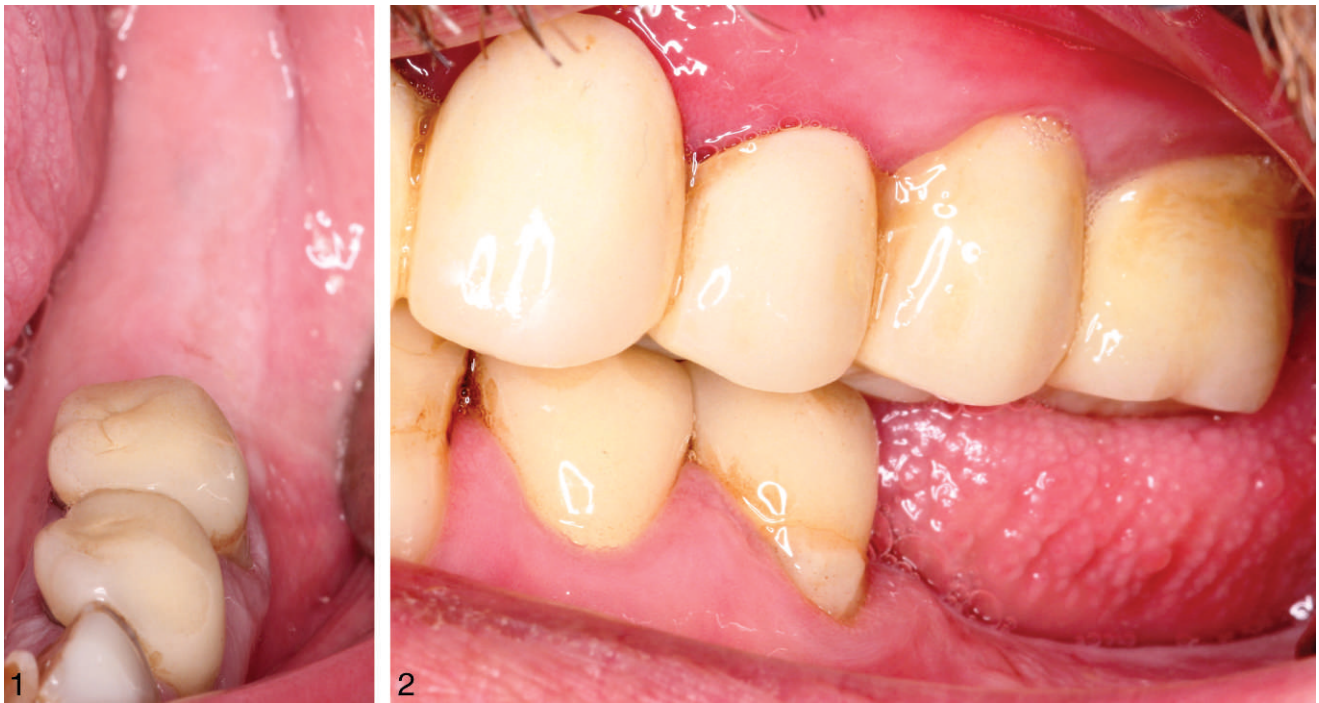
FIGURES 1 AND 2. FIGURE 1. The patient presented with an edentulous mandibular left. FIGURE 2. There was loss of vertical bone.

esthetics (Figure 5). After the patient's approval, the definitive splinted crowns were cemented with resin cement (Maxcem Elite, Kerr) (Figure 6). The tissue level zirconia margins are kept clean with daily