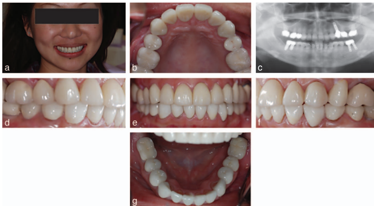
FIGURE 5. Definitive prostheses. In the maxillary arch, teeth #3, 4, 5, 13, and 14 were restored with ceramometal crowns, and teeth #6, 7, 8, 9, 10, and 11 were restored with all-ceramic lithium disilicate glass-ceramic crowns made using computer-aided design/computer-aided manufacturing (CAD/CAM) techniques; implant #12 was restored with a Zirconia CAD/CAM milled abutment and an all-ceramic lithium disilicate glass-ceramic crown CAD/CAM. In the mandibular arch, implants #18, 19, 30, and 31 were restored with titanium custom CAD/CAM abutments and splinted ceramometal crowns; teeth #20, 21, 28, and 29 were restored with all-ceramic lithium disilicate glass-ceramic CAD/CAM crowns; and teeth #22, 23, 24, 25, 26, and 27 were restored with all-ceramic lithium disilicate glass-ceramic pressed veneers.

bonded restorations in 3 patients with DI over a 10-year period. Within the limitations of this report, it seems that the bonding was not compromised from the dentin defect resulting from DI. Similar case reports have suggested that bonded all-ceramic restorations, especially CAD/CAM-manufactured all-ceramic restorations, can be used successfully in patients with DI. 23–25