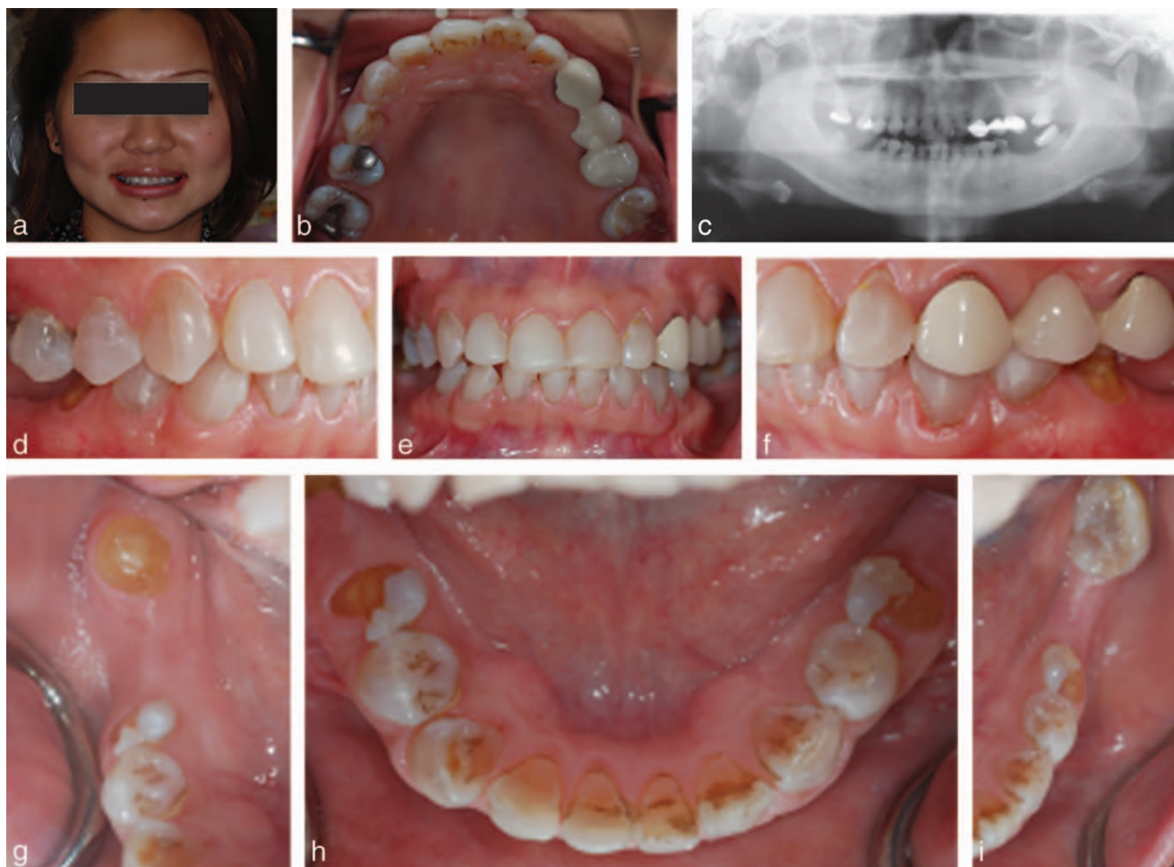
FIGURE 1. Pretreatment assessment. (a) Extra-oral photograph. (b) Maxillary arch. (c) Panoramic radiograph. (d) Right occlusion in maximal intercuspital position (MIP). (e) Front occlusion in MIP. (f) Left occlusion in MIP. (g) Mandibular right posterior. (h) Mandibular anterior teeth and premolars/ (i) mandibular left posterior.

maxillary occlusal splint and establish a periodontic and prosthodontic recall schedule.